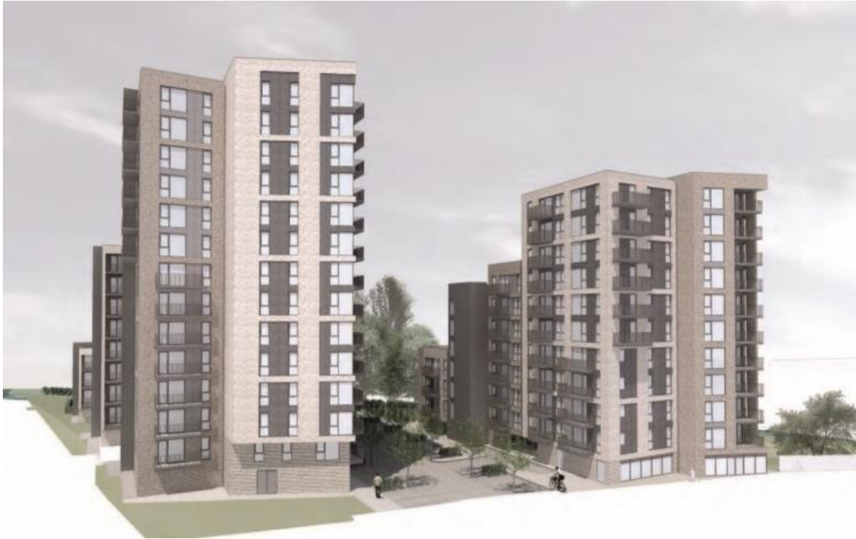
Figure 1.1: Image of the Hampden Road Development

In addition, we would like to highlight that in October 2016 LBH granted planning permission (ref: HGY/2016/1573) for a redevelopment at 'Railway Approach Hampden Road, N8 OHG' for the provision of two buildings between 4 and 14 storeys in height comprising 174 residential units. The residential density of the scheme equates to 715 hrph. See figure 1.1 below.