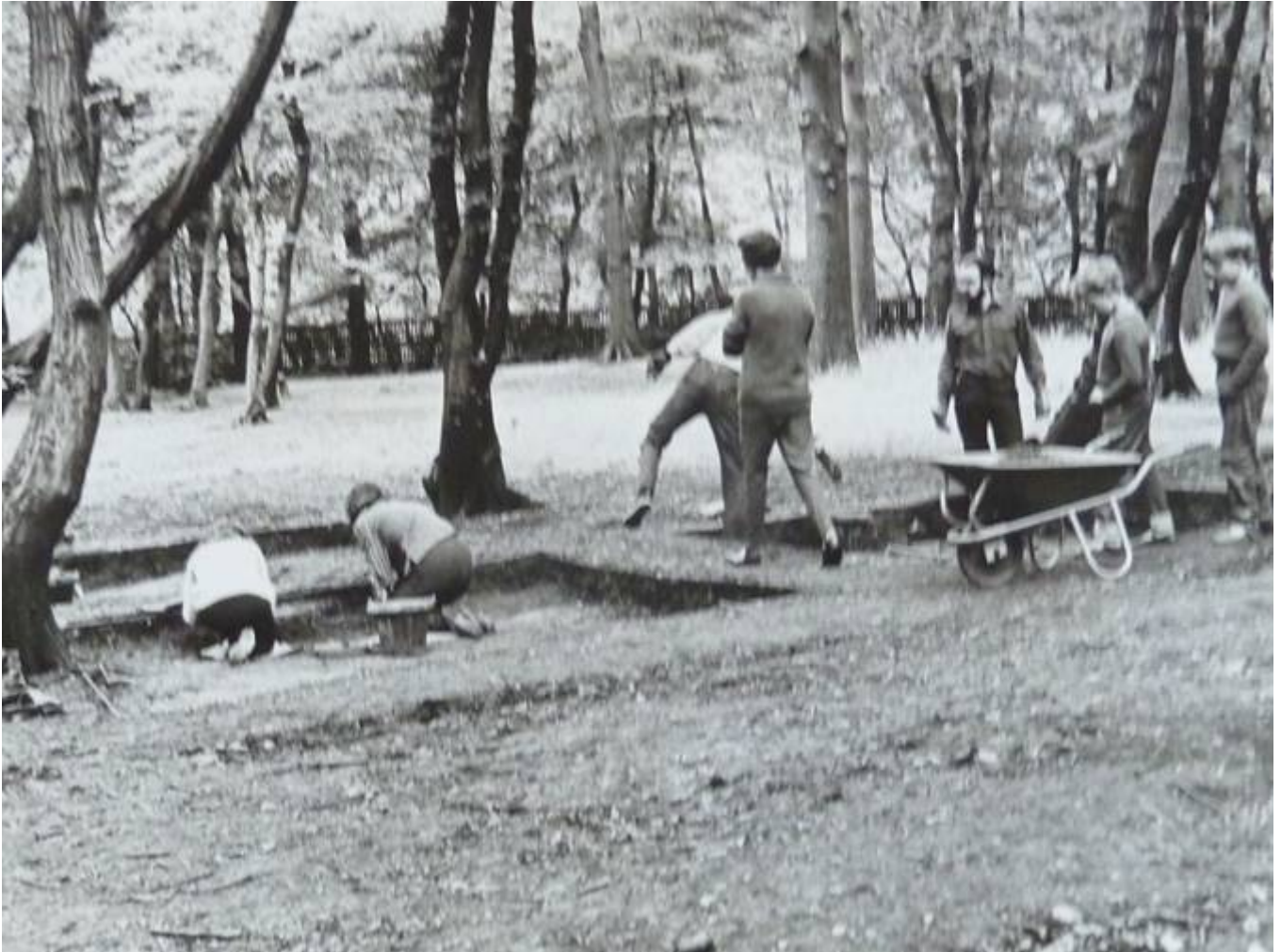
Excavating the kilns at Highgate Wood