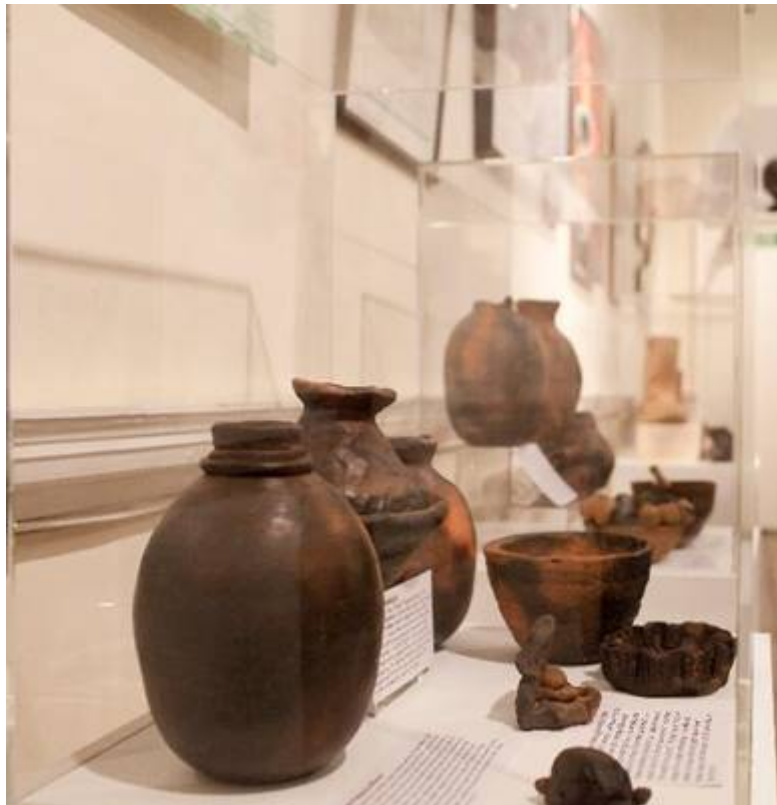
Here are a few photographs taken at Bruce Castle at the launch of the exhibition Haringey Potter in 2010.