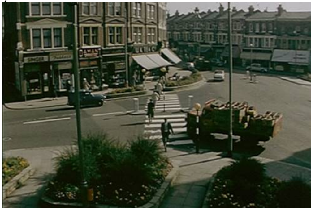
A still from the film

There is also an option to add your own comments about the film in the column provided by LSA. Please do so!