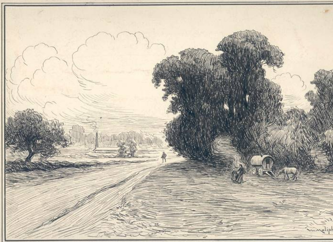
WHITE HART LANE. 1908.

paintings of the Usk Valley in Monmouthshire (you can see one of his Welsh landscapes here ). He is also known to have painted portraits as well as a significant number of illustrations published in books and magazines survive, including ' Sunday at Home ', ' Boy's Own Paper ', ' Children's Magazine '.