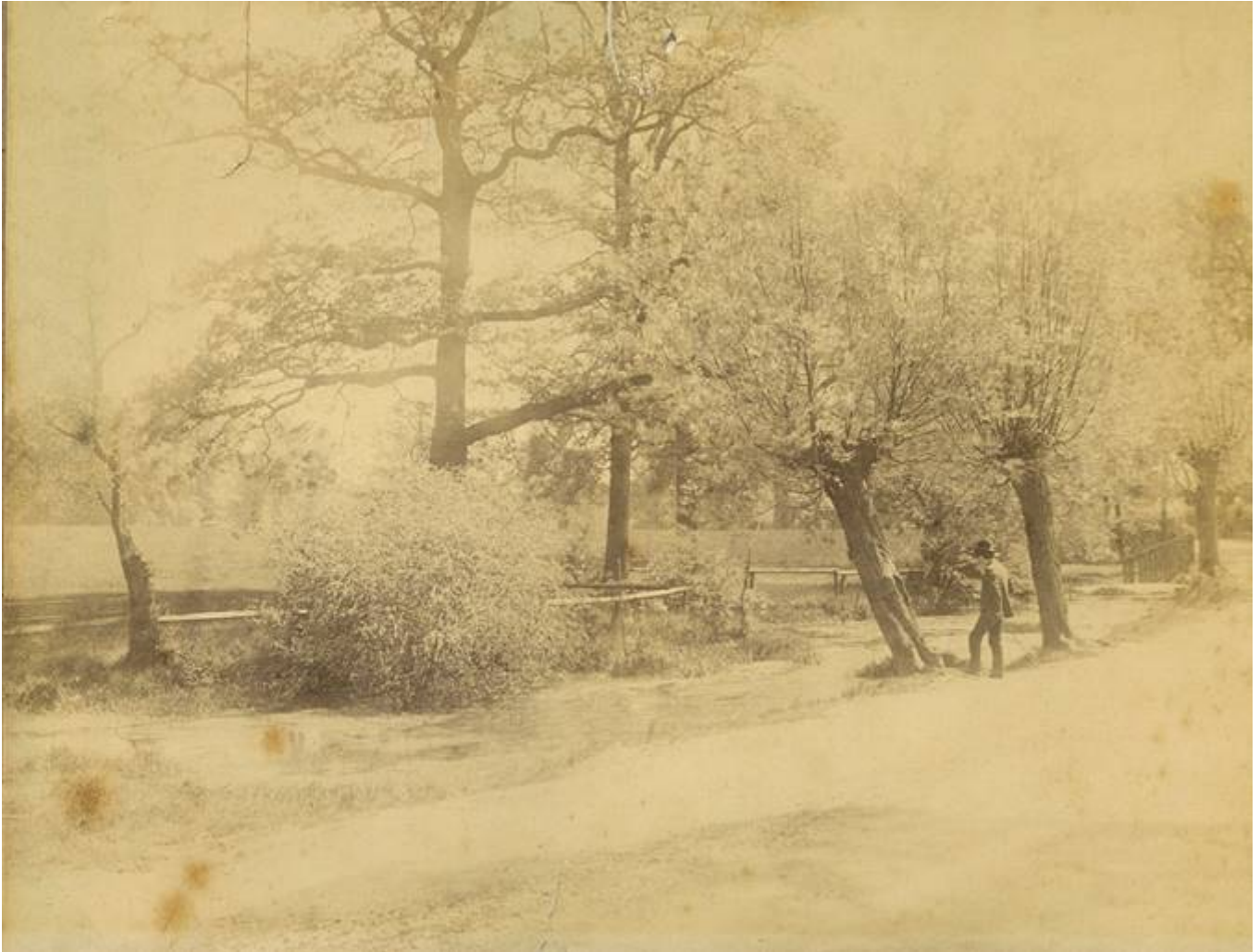
William standing in 'Powis Lane' in c.1890. It is likely that this is Powys Lane (different spelling) in Southgate.