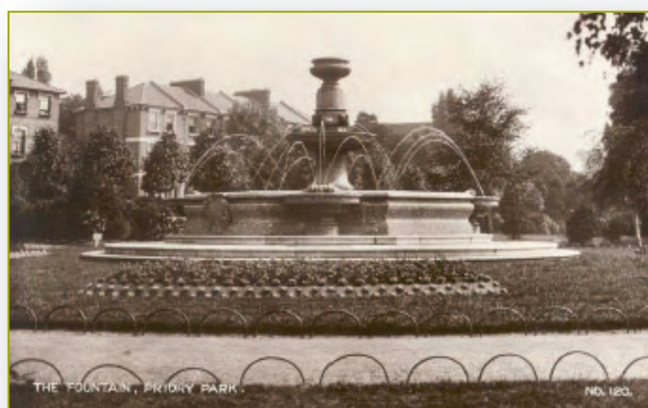
The Fountain ▼

The fountain bears the Arms of the City of London and is made of 50 tons of Lamorna granite. It originally boasted a vertical jet of water from the base and four jets that spouted up into the upper basin, but in recent years has acted as an impressive planter.