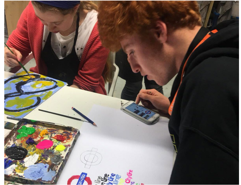
Artists working at Artbox, London