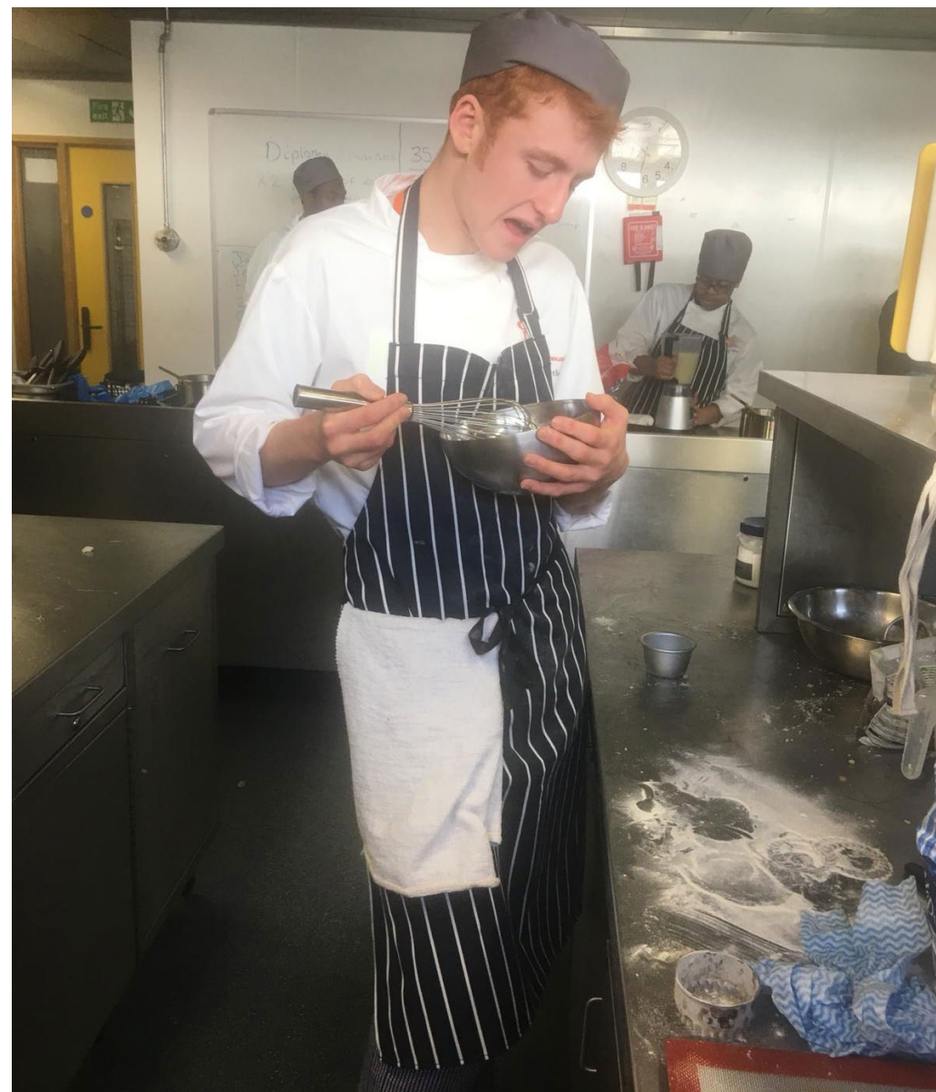
Professional cookery students at Haringey Sixth Form College