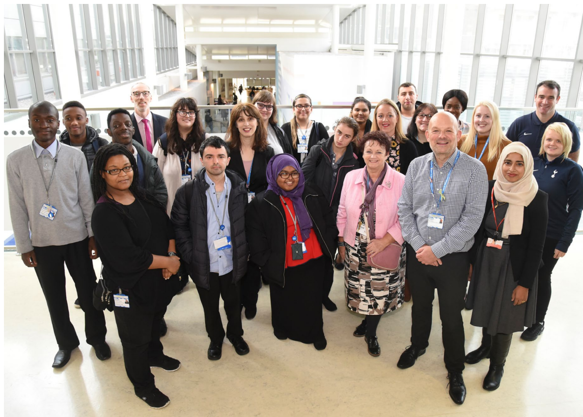
Interns and staff at PROJECT SEARCH North Middlesex Hospital Supported Internship.

This document is also useful for young people with health and care needs that do not have an Education, Health and Care plan.