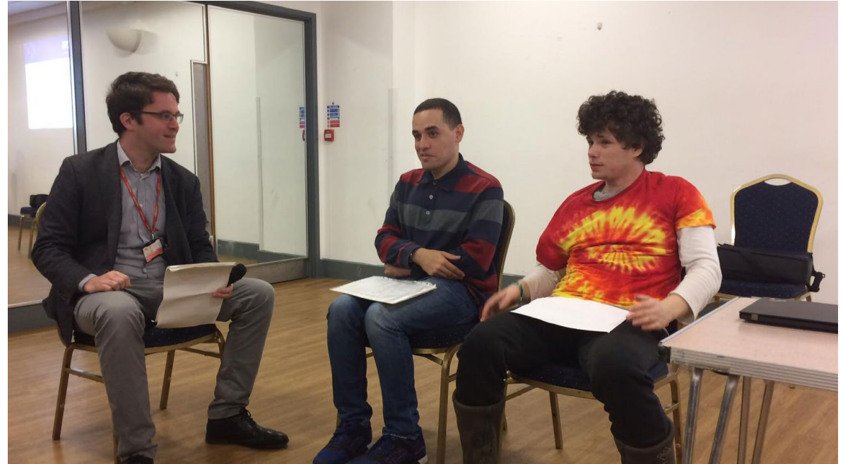
Haringey students at the Transition Event speaking about supported employment and work experience.