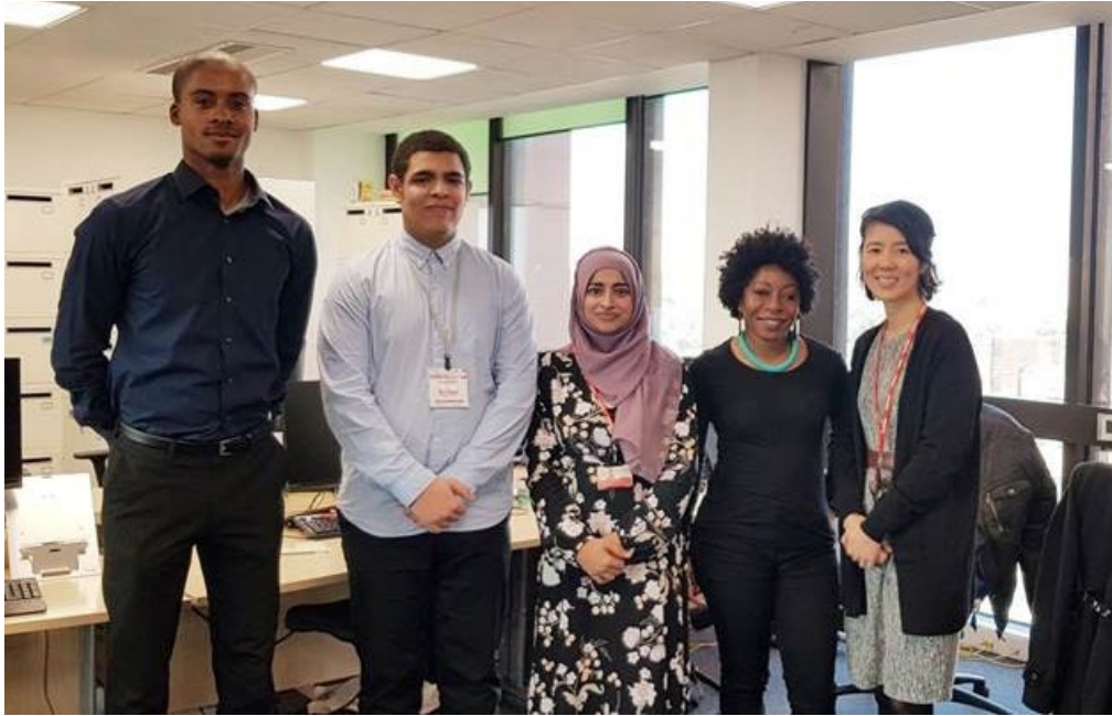
Work experience student with colleagues at Haringey Council.