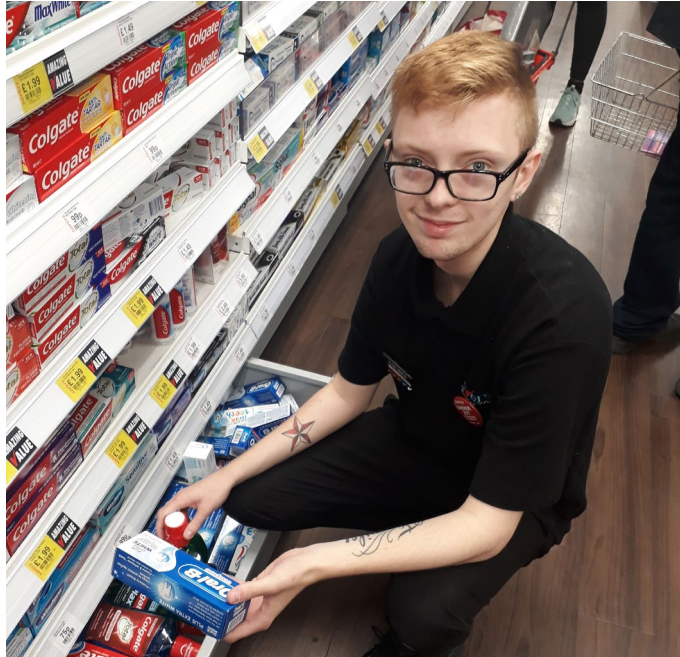
Supported employment placement from my AFK at Savers store.