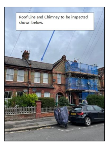
Roof line with chimney stack

The data obtained from the surveys are now being reviewed and actioned. Residents will be informed about the programme of works.