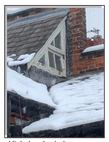
High level window

Drones have recently been utilised to carry out photographic surveys on the Noel Park Estate. They were used to capture aerial photographs of the properties' roof line and high-level windows to assess their condition and state of repair prior to the scaffolding being erected. The images below indicate the areas that were inspected.