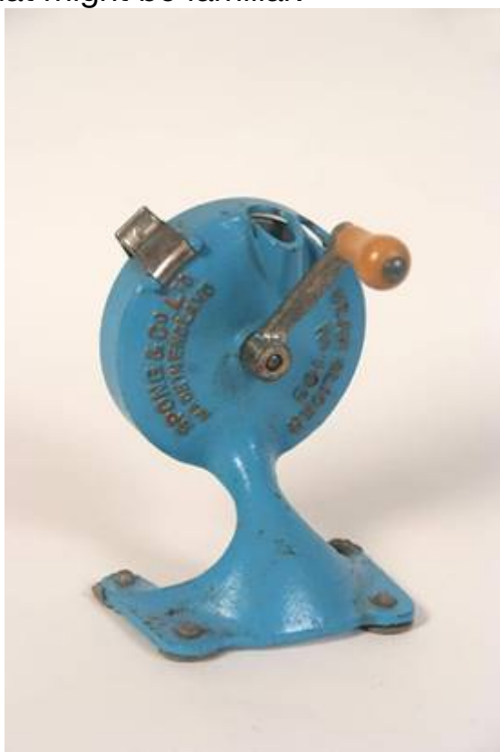
Spong bean slicer, 1930s.

So, here's our gadget that might be familiar.