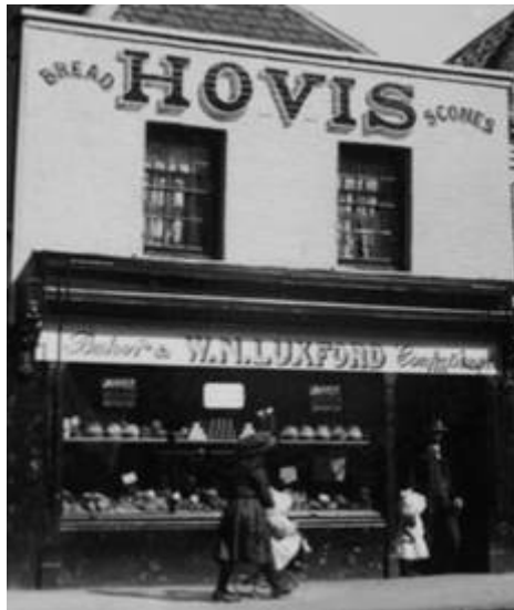
Luxford's the bakers at Scotland Green, c.1905