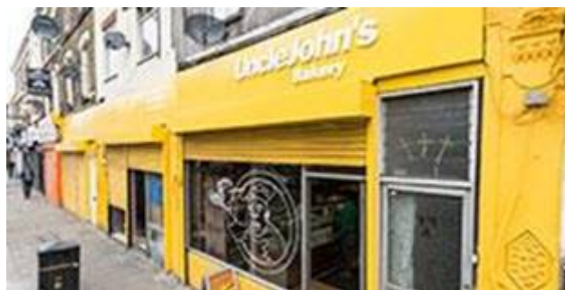
Uncle John's bakery in West Green Road, 2019

Other bakers we may miss visiting ourselves today include the Ghanaian bakery Uncle John's in West Green Road, Tottenham, selling not just bread but delicious patties too.