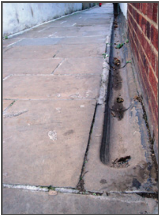
Fig. 1 (John Hinshelwood, 2007)

In the 1870s, the Hornsey Outfall Sewer was built across the parkland of Haringay House. The Haringey Passage marks the line of this sewer.