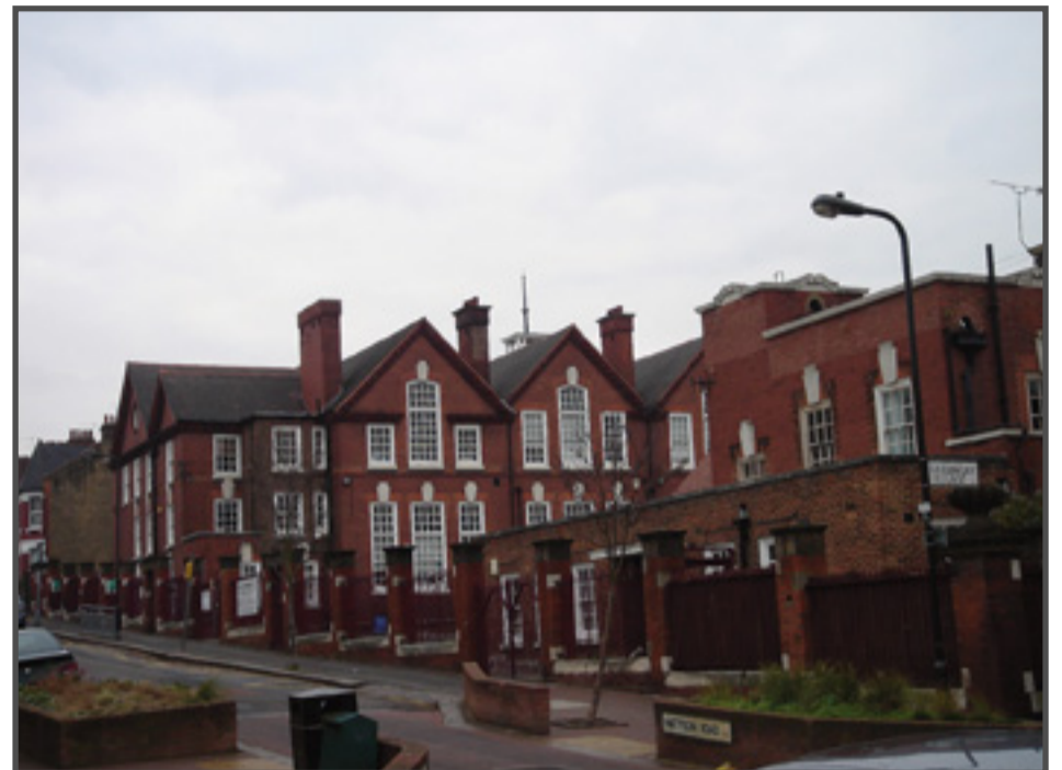
Fig. 2 (John Hinshelwood, 2007)

The Haringey Passage provides a safe walking route above the sewer between the houses on the Ladder. This is particularly valuable for children attending the two schools.