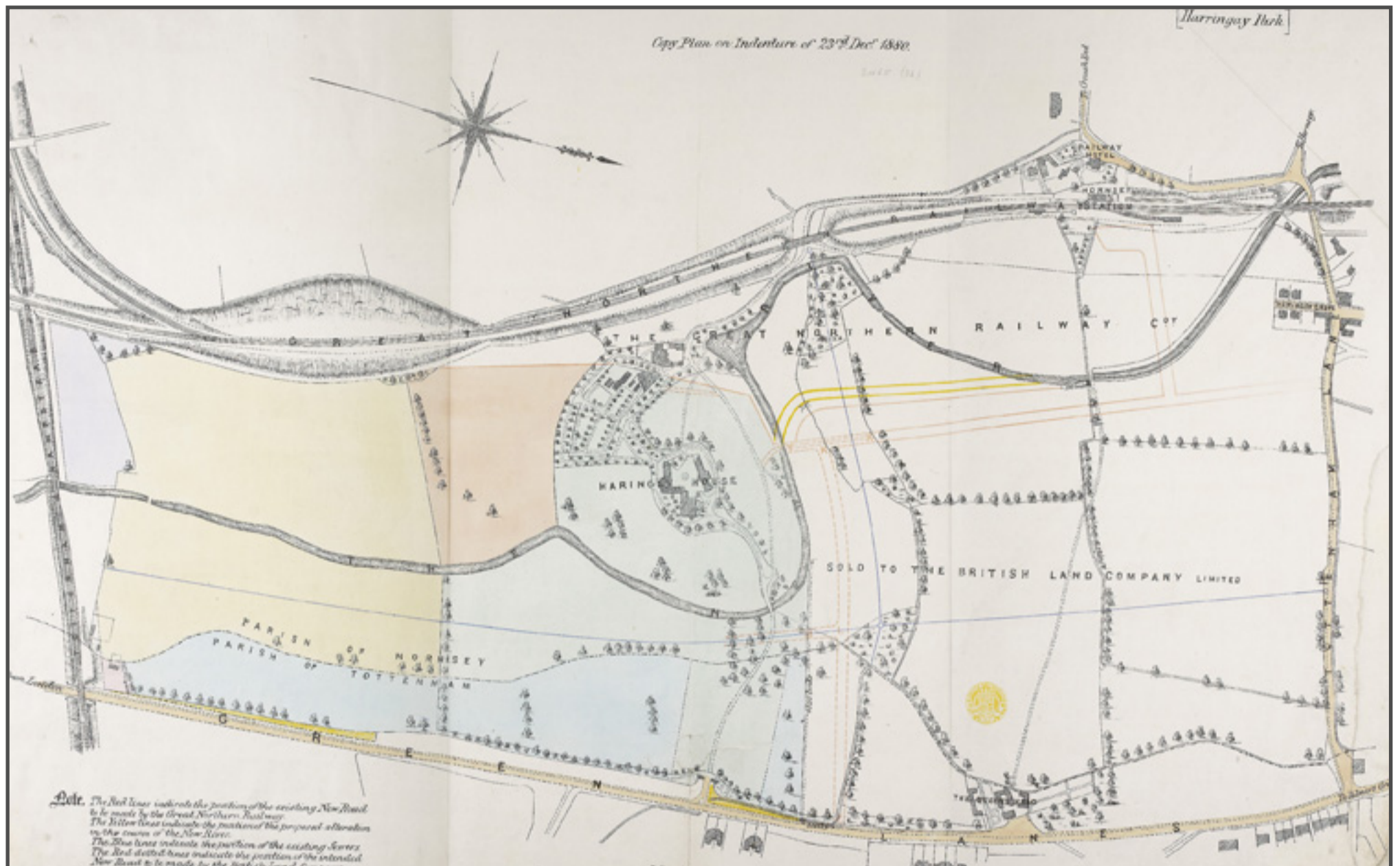
Haringey Park as it was in 1880s.

The Haringey Ladder was built across land that was once the estate of Haringey House, which stood at the summit of the hill between Allison and Hewitt roads. In 1880 the estate was open land with a sewer (shown by the blue line) and the new River running through it. Before the sewer was built, Hornsey had to pay Tottenham to dispose of its sewage in the river Lea.