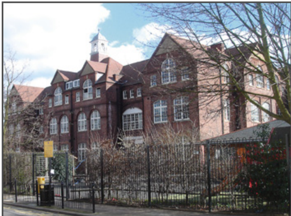
Fig. 1 (John Hinshelwood, 2007)