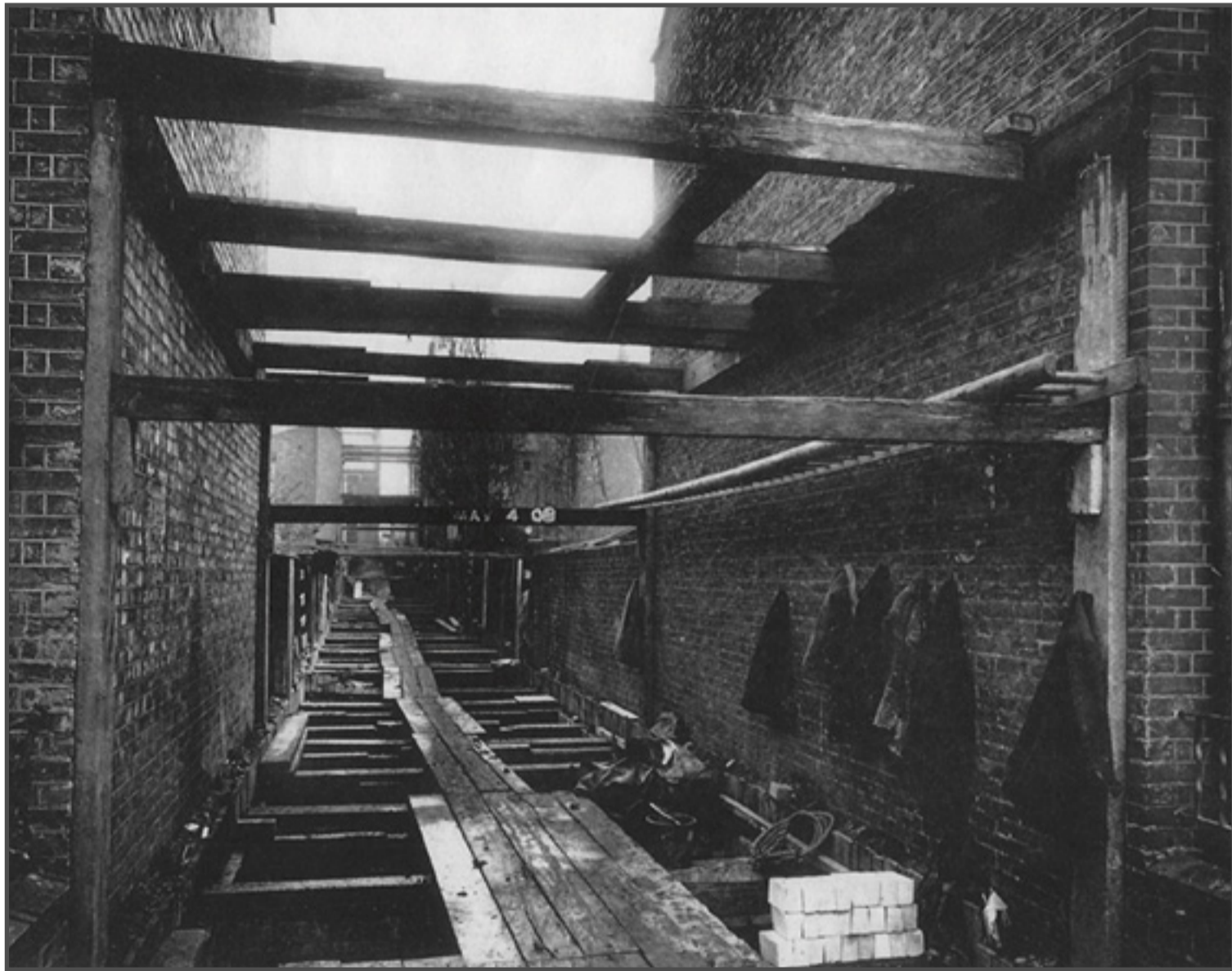
Up-grading works to the sewers, Fairfax Road, 1903.

When Harringay Park was sold off and Harringay House pulled down the Ladder streets were laid out in their place. As the houses were built the space over the Hornsey Outfall Sewer became a footpath. Paving the first part of the passage started in 1887-8. The second section was paved in 1889-90.