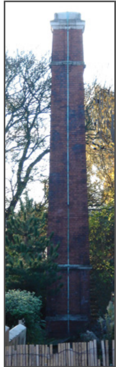
Fig. 3 (John Hinshelwood, 2007)

There are still some old York paving stones (Fig. 1), laid at the time of the building works. Some original moulded rainwater gullies and drain covers can still be found.