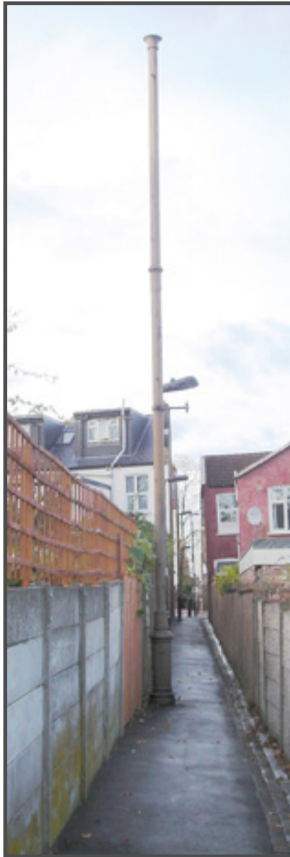
Fig. 2 (John Hinshelwood, 2007)