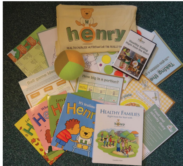
The HENRY Parent Toolkit – free to everyone joining a HENRY programme

The HENRY toolkit will help you give your child a great start in life, get the whole family involved, and keep track of how well you're doing.