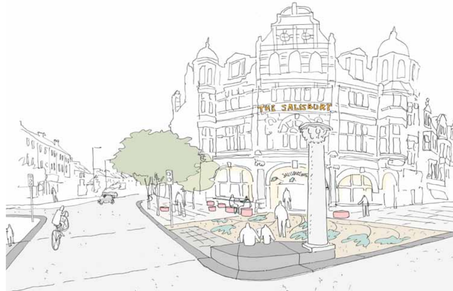
4: St Ann's Road junction