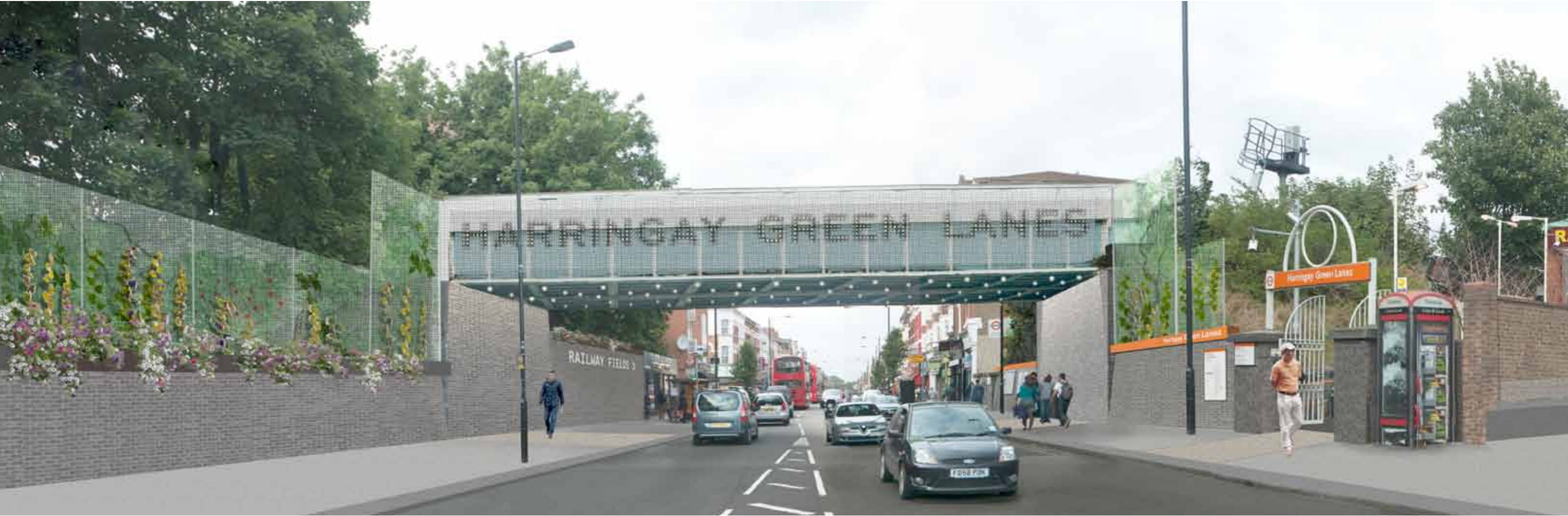
1: Overground bridge environs