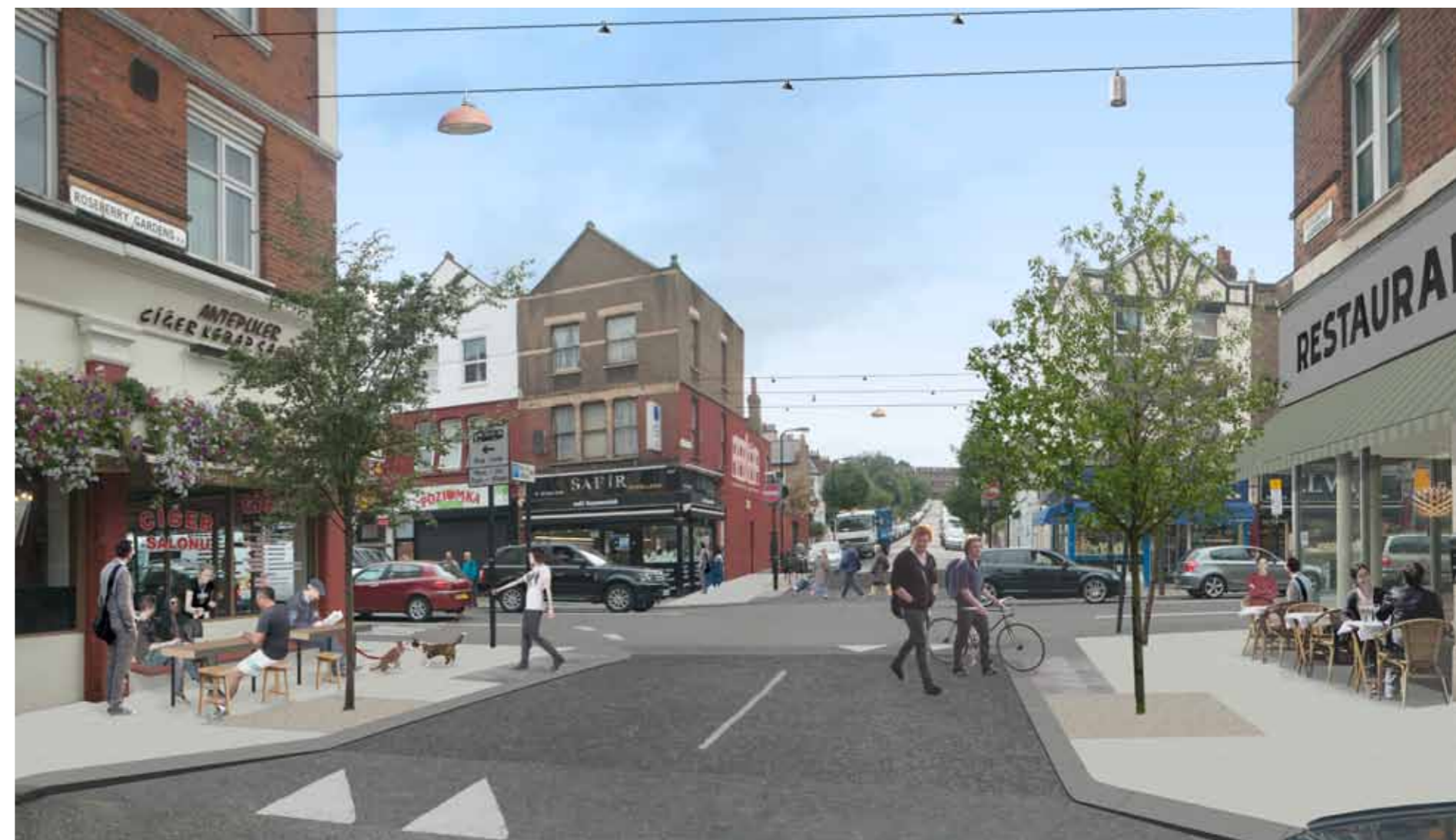
3: Roseberry Gardens and Duckett Road