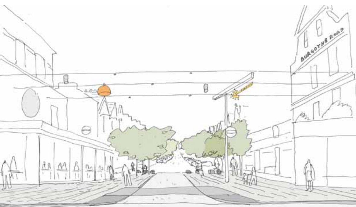
2: Burgoyne Road junction