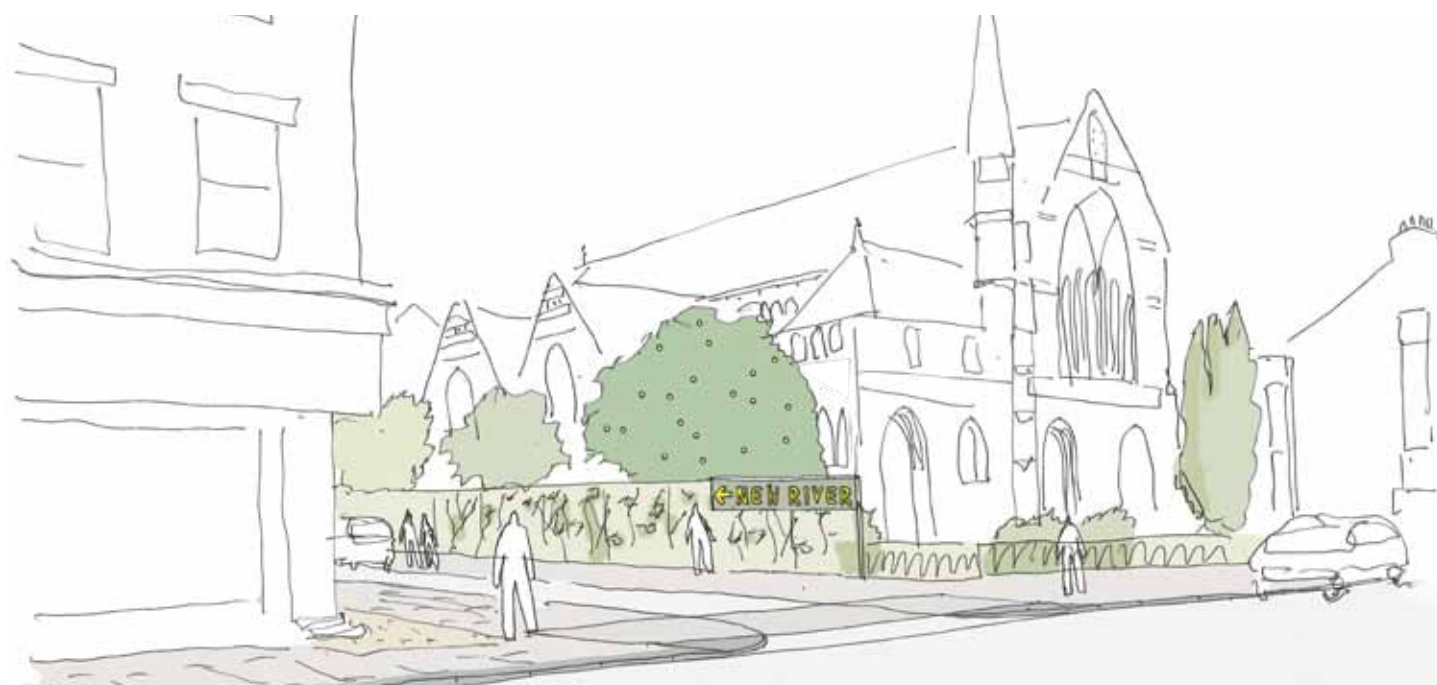
5: Allison Road junction

www.haringey.gov.uk/public_realm_improvements