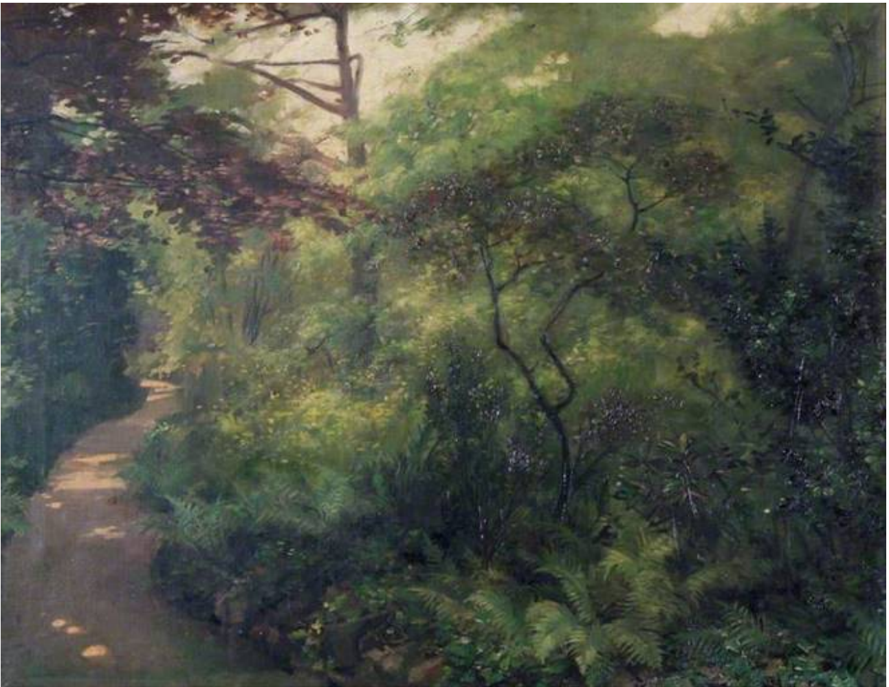
This very peaceful and inviting painting 'A Tangle in My Garden', was painted by Beatrice Offor in 1917. It shows the Beavans' garden at 8 Bruce Grove.

The painting was exhibited at the Royal Academy that same year, 1917.