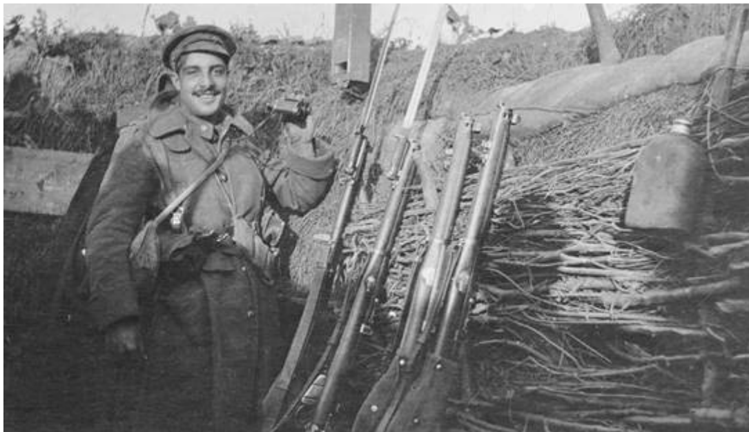
This image shows Ectos in the trenches on the Western Front, with rifles, bayonets, and a periscope to look out across the enemy lines c.1915.