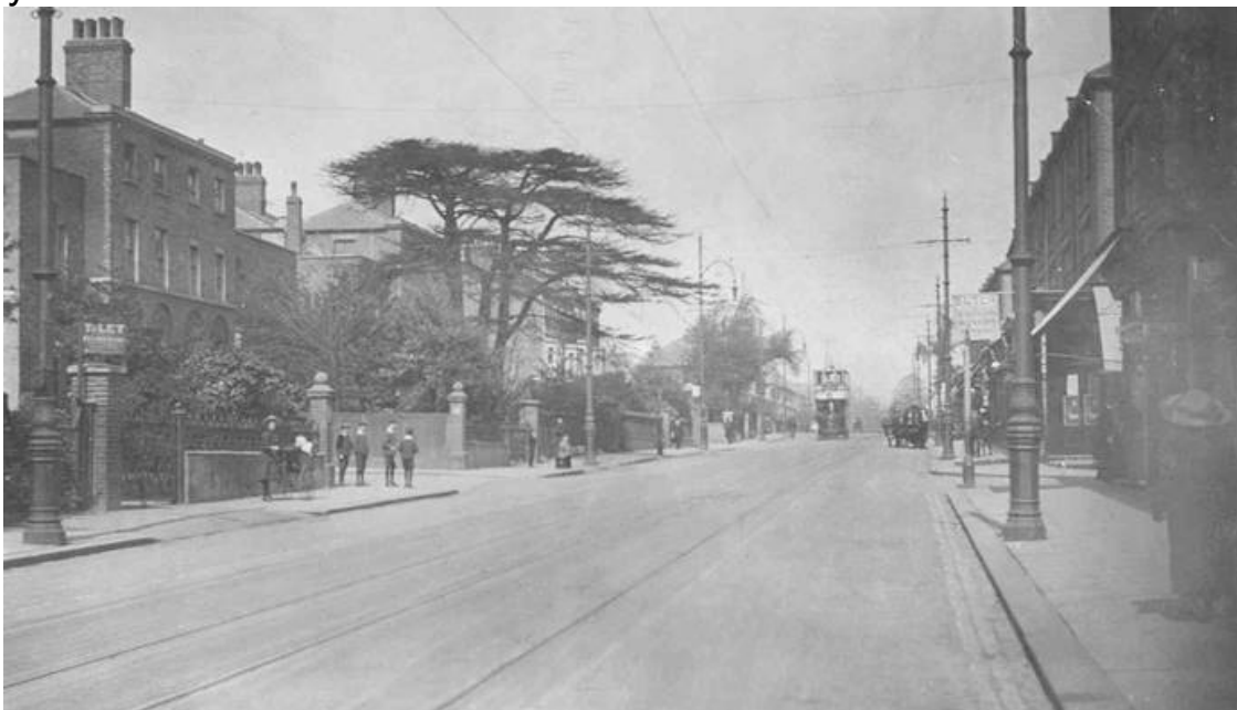
Bruce Grove 1911, looking towards Lordship Lane, with the tram to Wood Green

So, to help illustrate how you might go about doing some of your own research we're going to take as an example some neighbours that lived in Bruce Grove in the early 1900s.