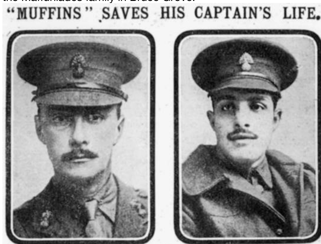
Newspaper cutting, from unknown source, 1916