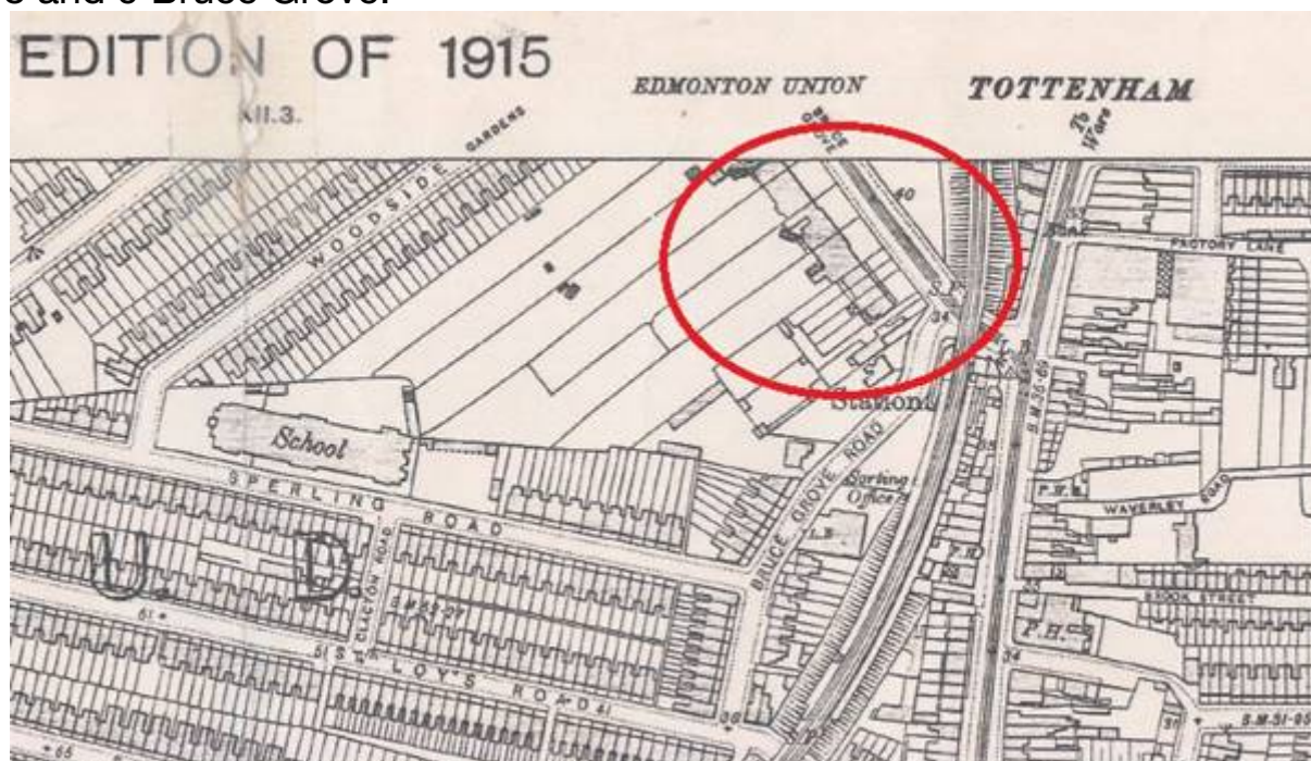
Ordnance Survey Map 1915

Tottenham, with Bruce Castle at the top. The Ordnance Survey Map of 1915 shows us some very large houses set back from the road with gardens (circled below in red) just by the station. This is where we are looking today, especially at nos.8 and 9 Bruce Grove.