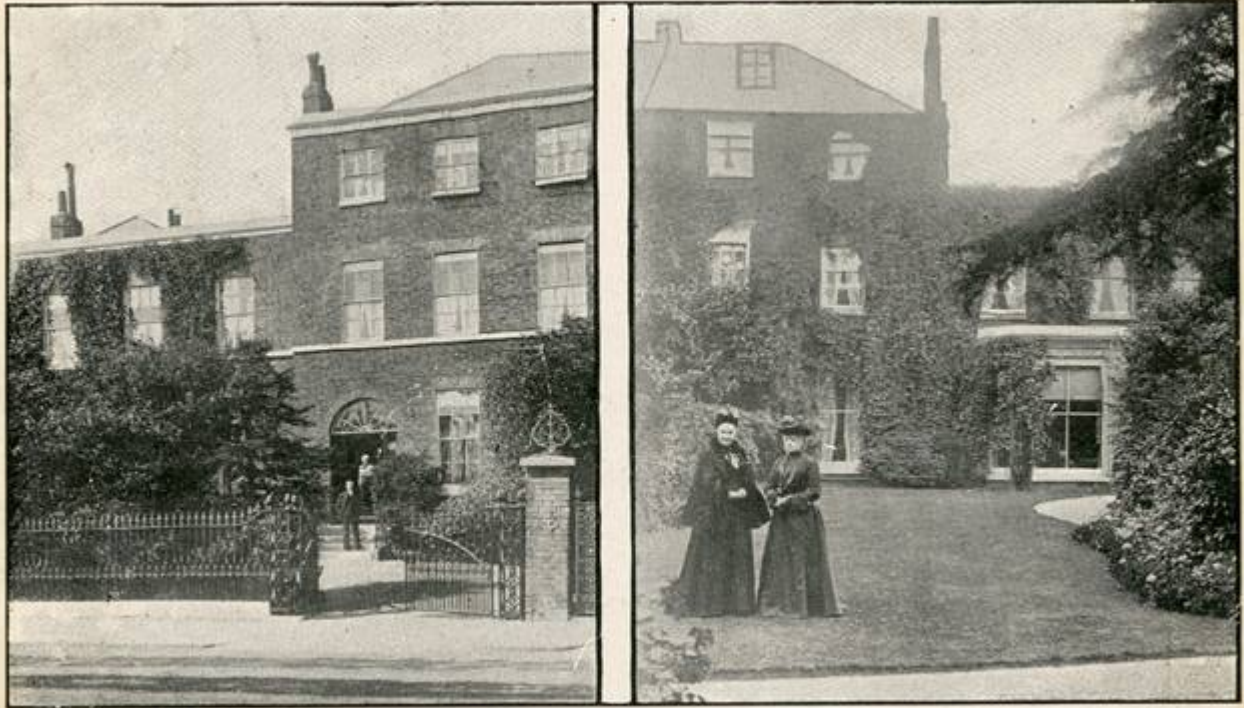
HOME FOR MISSIONARIES, 7 BRUCE GROVE, TOTTENHAM.

These images are the front and rear views of Number 7 Bruce Grove in 1907, when it was a Home for Missionaries.