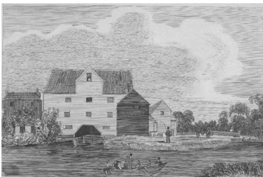
Tottenham Mills on the Lea, early 19 th century.