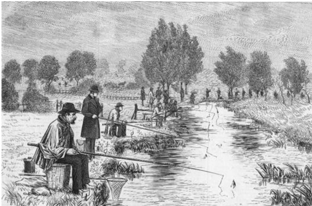
Fishing competition at the Mill Stream, Tottenham Hale, 1875

It is not all fun though, as fishing can be quite a competitive sport. As well as the friendly rivalry between the fishermen themselves, club competitions were, and still are, popular. There is often a large amount of prestige (and sometimes money!) given to those who catch the largest fish or have the biggest overall catch. Some competitions asked people to catch certain types of fish, and as Walton's book makes clear, each fish has its own character and nuances. A good fisherman will need a variety of strategies in place to catch each type of fish. These can range from using different equipment, tackle and bait, to fishing at different times of day and at different places on a river. My Dad, in his 80s and a keen fisherman all his life, has a favourite reel over 50 years old that he swears by for catching bream, and has secret spots along his local river that he keeps very quiet about.