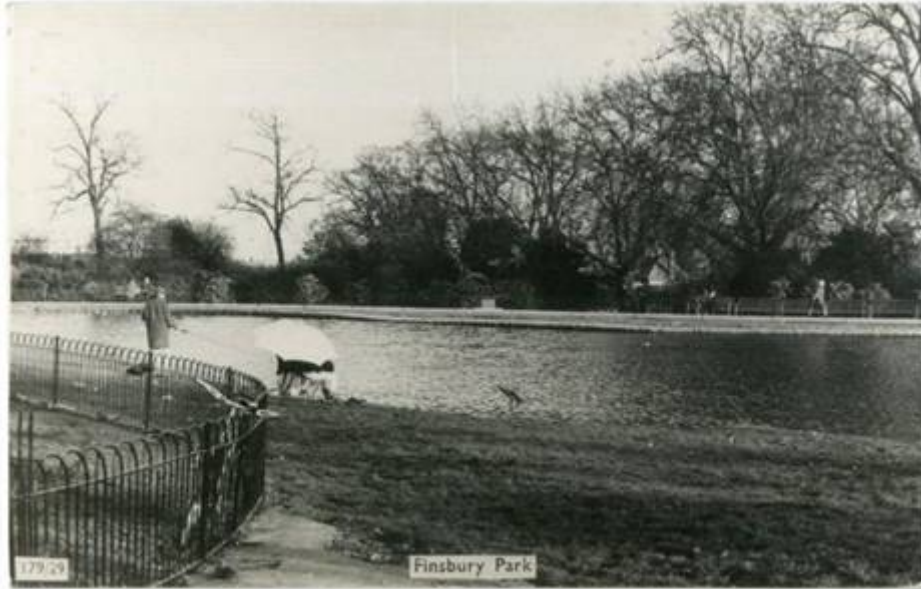
Finsbury Park's fishing lake, c.1950 - 60.