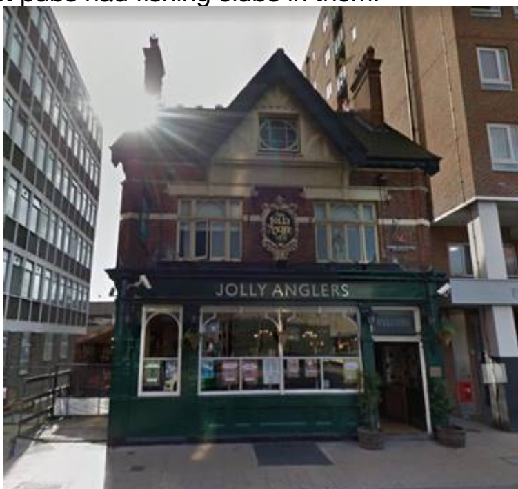
Jolly Anglers, on Station Road, Wood Green in 2015.

“The ‘Olive Branch’ pub used to have a fishing club. In the early part of the 19 th century, lads would walk down the towpath as far as Broxbourne but they’d get mugged - they called them ‘footpads’ in those days, not muggers. So they got together and this became the Olive Branch Fishing Club. And the ‘Elmhurst’ had the Broadwater Anglers, and the ‘Northumberland Arms’ had the Lansdowne Anglers. Near the ‘New River Arms’ in the 1950s there was a gravel pit used by fishing clubs. Most pubs had fishing clubs in them.”