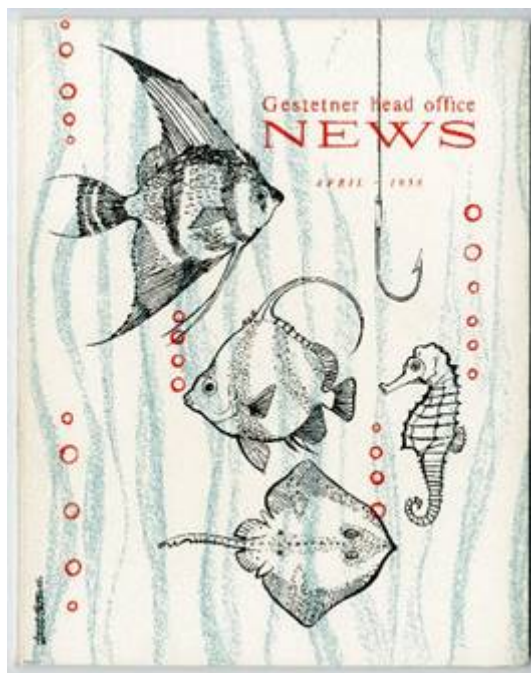
Gestetner Head Office News publication, April 1958

Anglers' Society and the Gestetner Angling Club when he was older (he worked for Gestetner's).