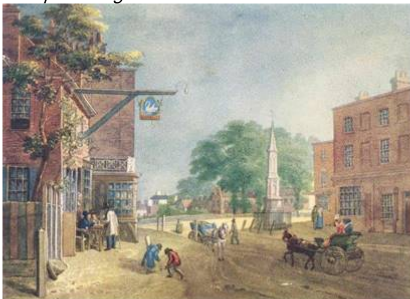
Tottenham High Cross, 1822. The scene shows Tottenham High Road and horse-drawn carriages with the Swan Inn at left, with its distinctive pub sign, and the High Cross at centre.

'The Swan Inn: This famous old inn stands on the corner of Philip Lane nearly opposite the High Cross .... frequently visited by noted anglers..... It was the place of resort of Isaak Walton, the angler; he used to tarry here awhile before he went to the River Lea to fish, and again on his return. In the front of this house, in 1643, there was an arbour the favourite resting place of Walton, of which mention is made in " The Compleat Angler ".'