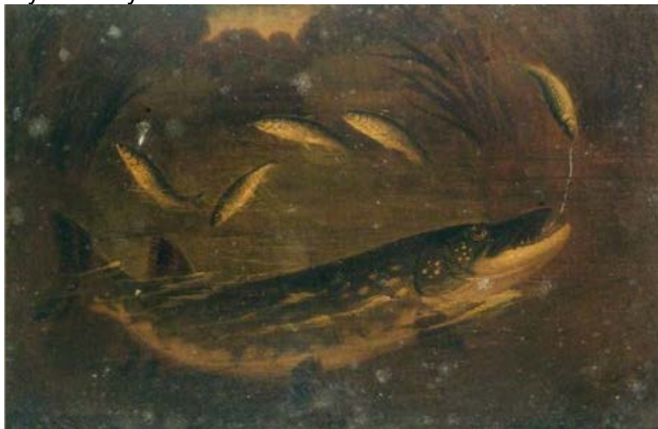
Into the Jaws of Death , artist unknown. 19 th century

In today's Forage Friday post, as lockdown restrictions have been eased a little this week to allow some more recreational activities, we are going to tell you 'A Fishy Tale'. So take your place on the banks of the borough's many waterways – rivers, canals, lakes, streams and ponds – cast a line in and let the slow pace of the water take you away.