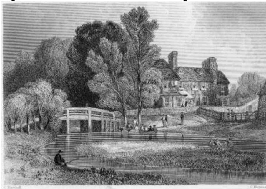
Hillyer's Bridge c.1830-40, more commonly known as Ferry Boat Bridge, on the River Lea. The Ferry Boat Inn can be seen in the background (and looks very much the same today on Ferry Lane by the reservoirs and the river).

We will stay with the Lea, and imagine Walton's characters walking along its banks, looking for the ideal fishing spots. Below are 19 th century prints of the River Lea showing bucolic scenes of people enjoying time by the river in boats or fishing, or taking in the riverside views whilst having a drink at the Ferry Boat Inn.