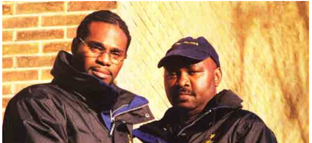
Haringey Street Enforcement Officers

Our street enforcement teams have already achieved excellent results and this will continue in order to create a clean, uncluttered and more attractive streetscape.