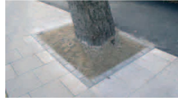
Good practice - porous resin bound gravel tree pit

We recognise that tree pits grills can act as litter traps. Therefore, porous resin-bound gravel should be provided within tree pits to allow water to reach the roots and to enable the safe passage of pedestrians.