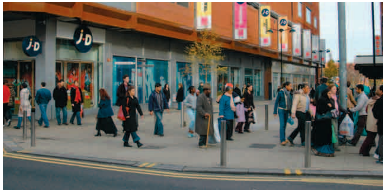
Contemporary furniture and high quality materials can promote town centre regeneration – Wood Green Town Centre

Various agencies and bodies are involved with our street environment, for example Transport for London and utility companies. We recognise a co-ordinated approach between ourselves and these agencies is necessary to achieve a high quality streetscape.