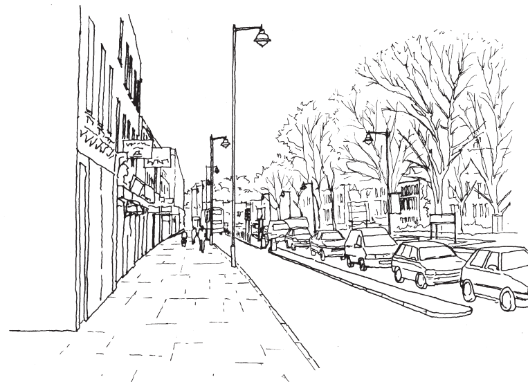
After - Uncluttered streetscape