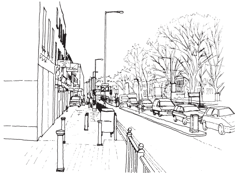
Before - Cluttered streetscape

It is recognised that some of Haringey's streets are increasingly cluttered with signs, bollards and guard railing which are unsightly and detract from the visual character of our Borough. However, we want to make a change, and create a more user friendly and attractive streetscape. The Manual identifies some key principles to help us achieve this change and these are discussed in the following chapter.