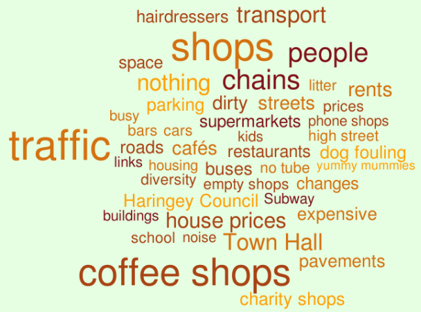
Q2 What do you dislike about Crouch End?