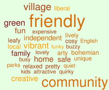
Q4 Three words that describe Crouch End?