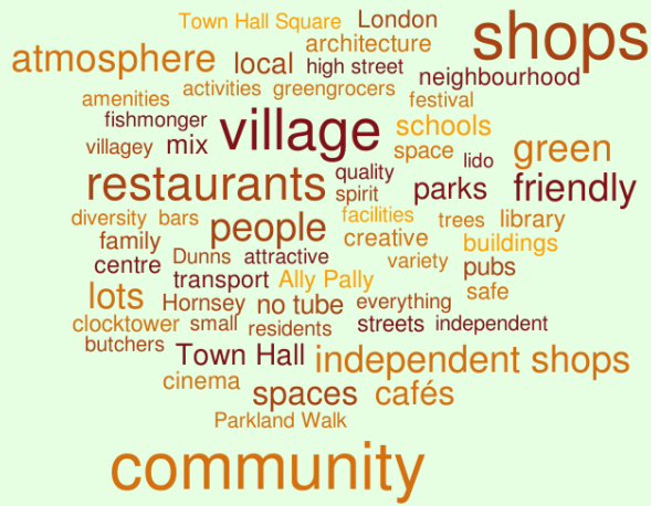
Q1 What do you like about Crouch End?