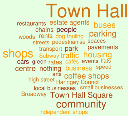
Q3 What would you change?