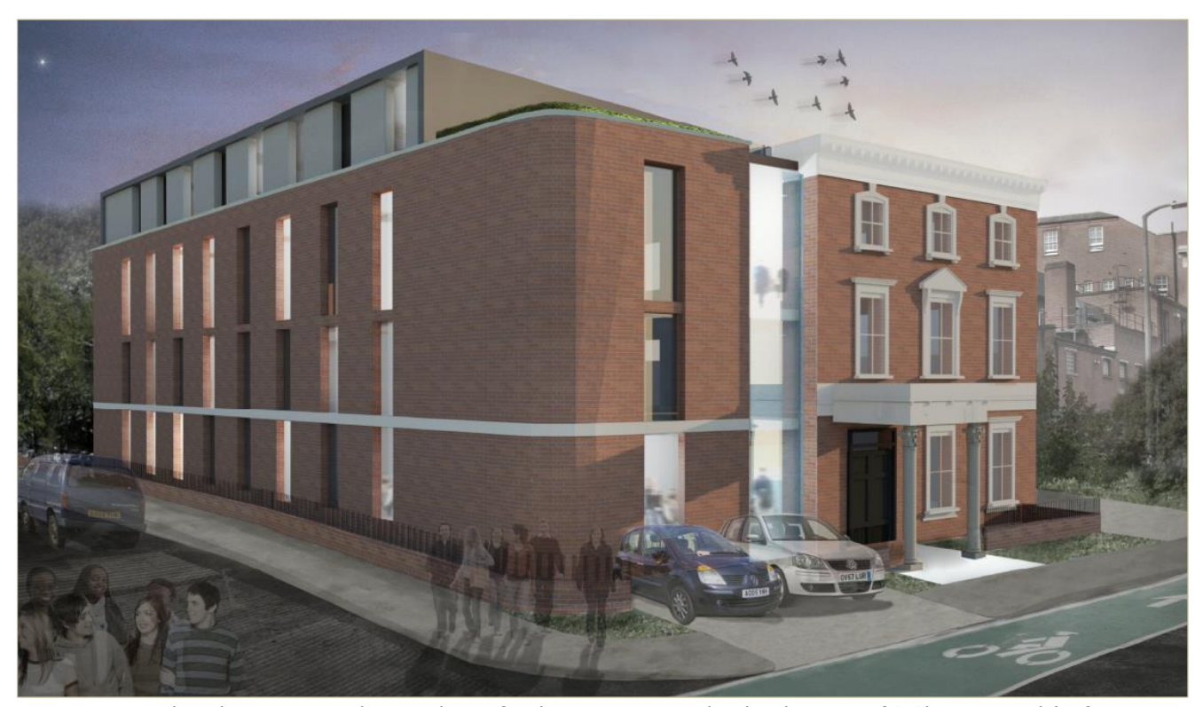
Approved student accommodation scheme for the extensions and redevelopment of 2 Chesnut Road (Ref: HGY/2013/0155)