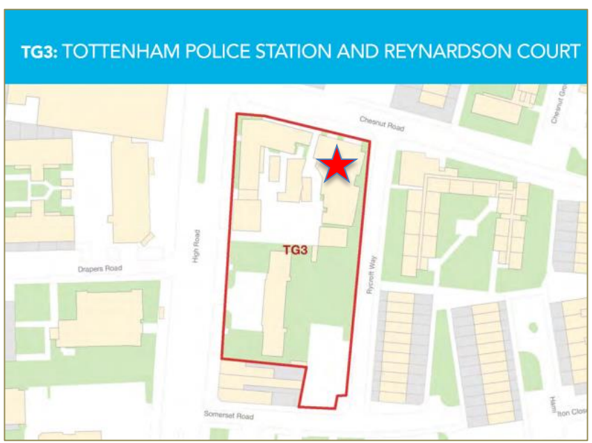
Tottenham AAP Site Allocation TG3 and 2 Chesnut Road

The allocation, as previously set out, fails to mention no.2 Chesnut Road and its relevant planning history as highlighted within the table above. This is a significant material consideration, since the principle of student accommodation has already been found to be acceptable via planning application HGY/2013/0155 which is in the process of being implemented.