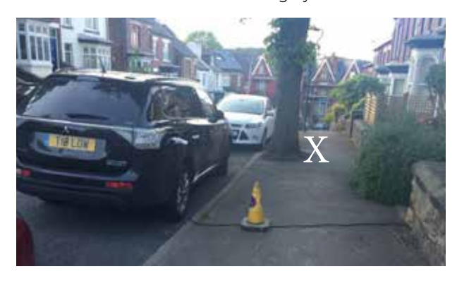
Figure 2. What not to do: A bare cable trailing across the pavement is a safety hazard.

This guide aims to show you what to do if you have an electric vehicle and want to charge your car at home.