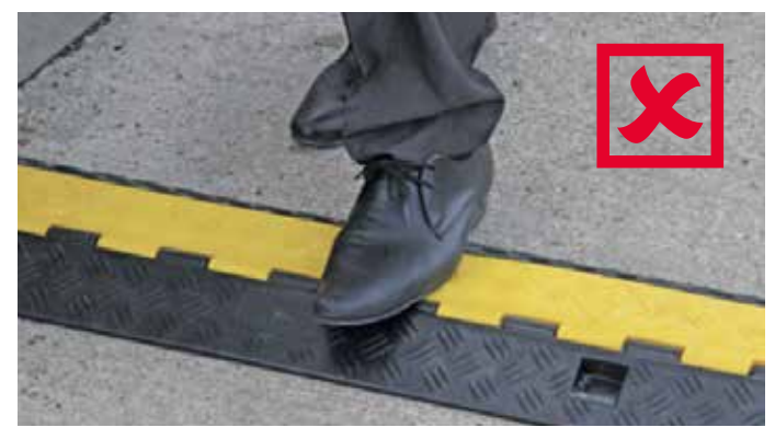
Figure 4. Cable protectors sit on top of the cable. This is still a health and safety hazard and is not permitted.