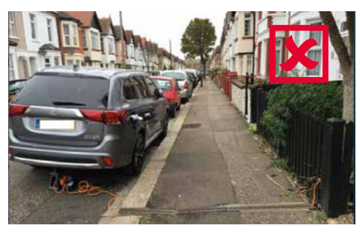
Figure 3. Pavement drainage channel, which is not permitted.