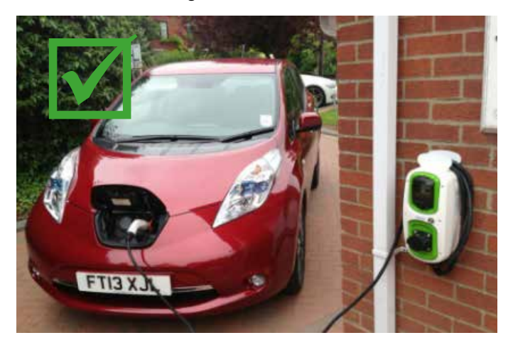
Figure 1. Electric vehicle charging point installed on a home1.

Those who have access to off-street parking (e.g. a driveway or garage) can install a charging point in their home, as shown in Figure 1.