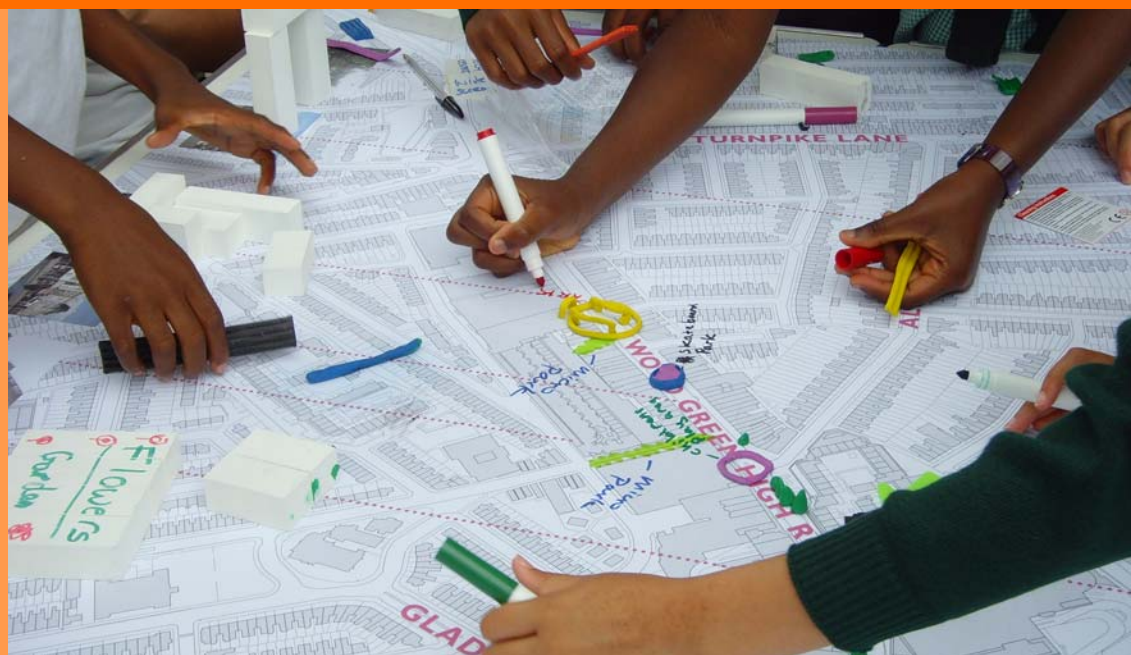
Cover images (from left to right)