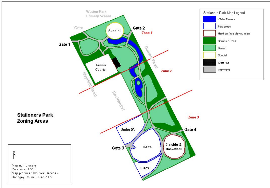
Figure 3: Stationers Park maintenance zone