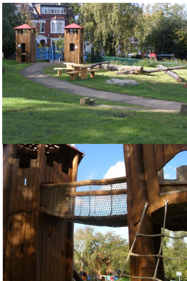
Figures above: The new play space in Stationers Park