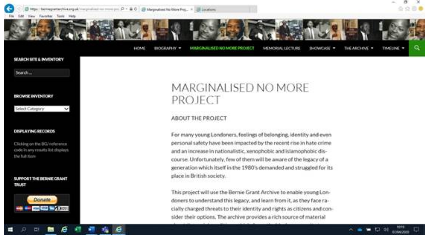
Screen grab of the Marginalised No More webpage on the Bernie Grant Archive website (April 2020)