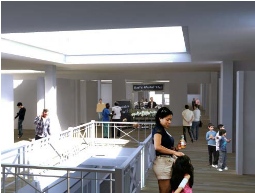
The restored first floor of the market