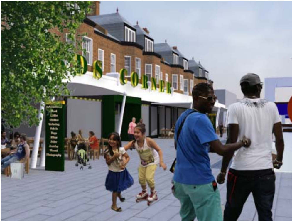
Front of the restored market

It also includes the additional bits of information that Haringey Council asked for after we submitted last summer. We are still waiting for it to be validated by the council, hopefully any day now. Excited to get feedback and a conversation going on about alternative development strategies.