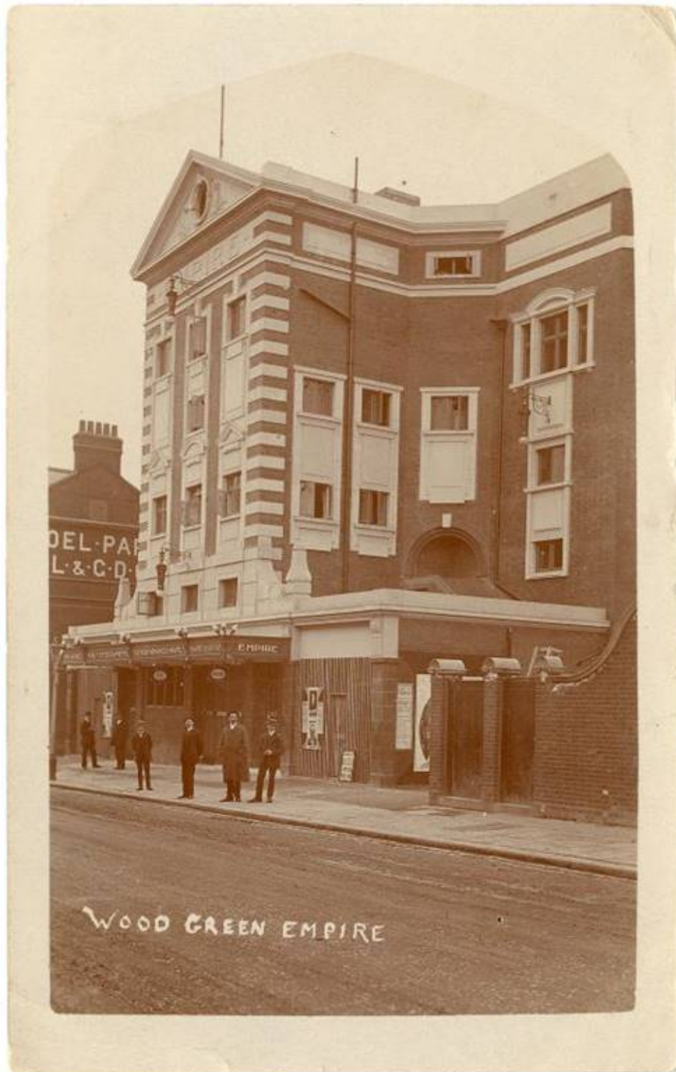
The back of the Empire, c.1910