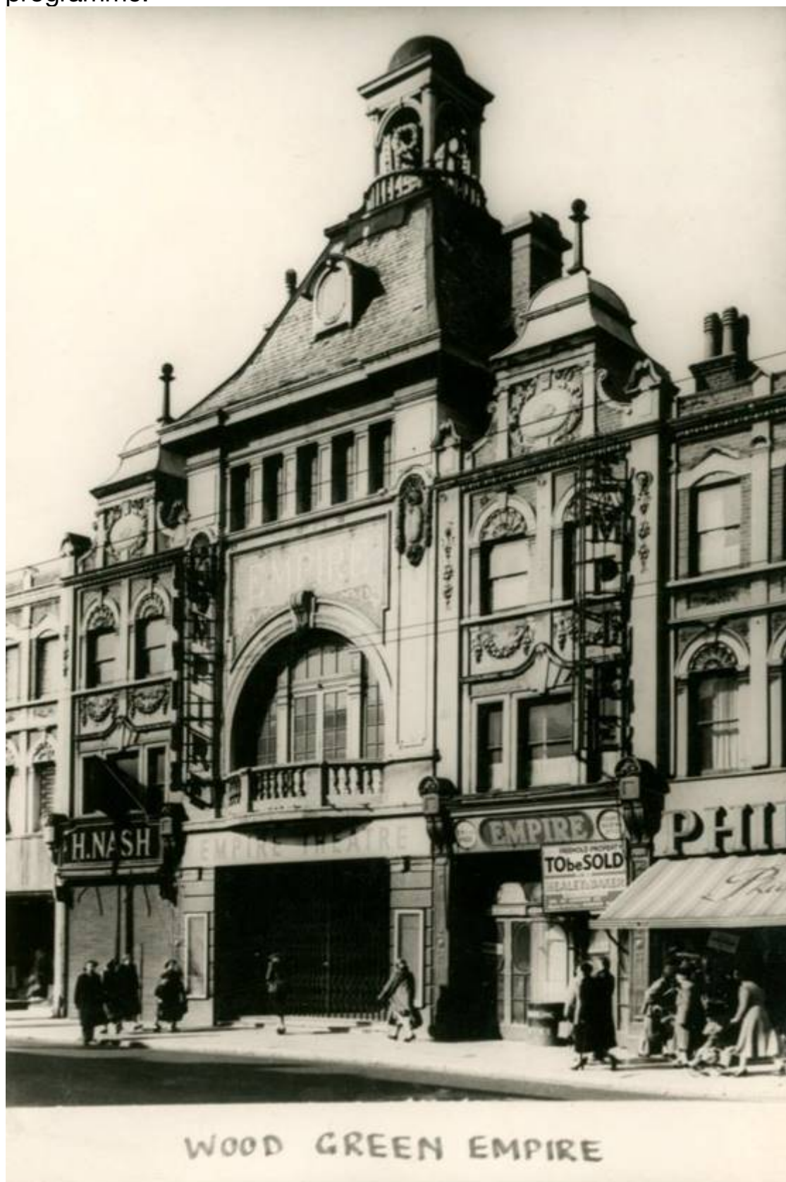
The theatre in the 1940s

parallel to the High Road, behind the Cheapside shops. The theatre had a capacity of almost 3,000 (including standing) over three levels - Stalls, Dress and Upper Circle. The stage was 37 feet deep and there were eight dressing rooms. As it was a purpose-built variety theatre, it was equipped with a cutting-edge Bioscope (early movie projector) from its opening, and films were a part of the variety programme.