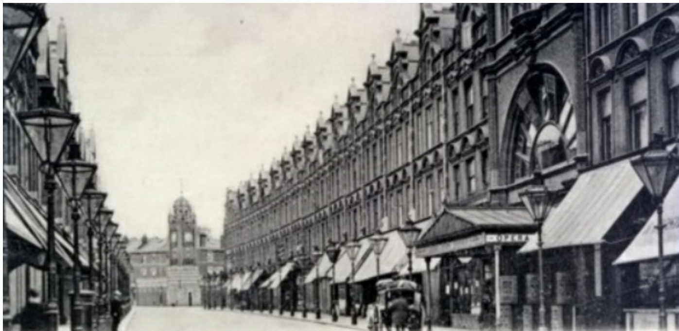
Topsfield Parade, Crouch End c1900 with the Queen's Opera House showing its distinct sun window above the entrance and the veranda set into the footpath.

It was a relatively small theatre, with a seating capacity of 1,200, but it still hosted some big names in its early years including Ellen Terry and Lillie Langtry. In 1907 the theatre was renamed the Crouch End Hippodrome hosting variety performers and some plays and in 1913 it was refurbished again to become a full time cinema.