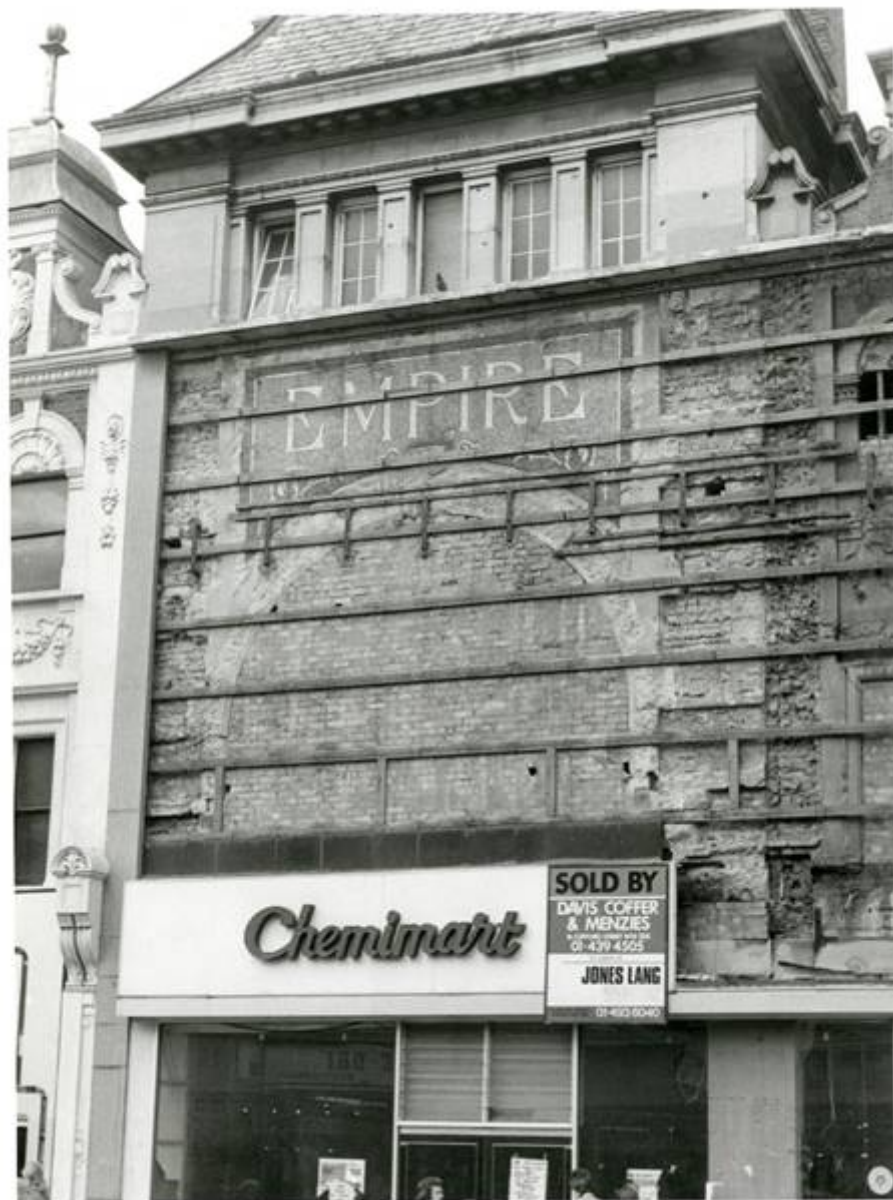
The building still showing some of the original signage in the 1970s.