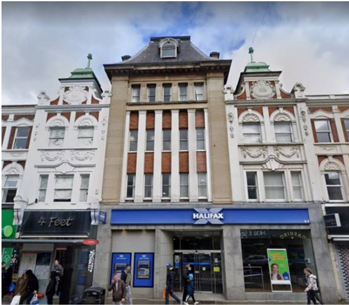
The Empire in 2019, with extensive changes in the lower and middle sections, and the removal of the turret and cupola of the original building.