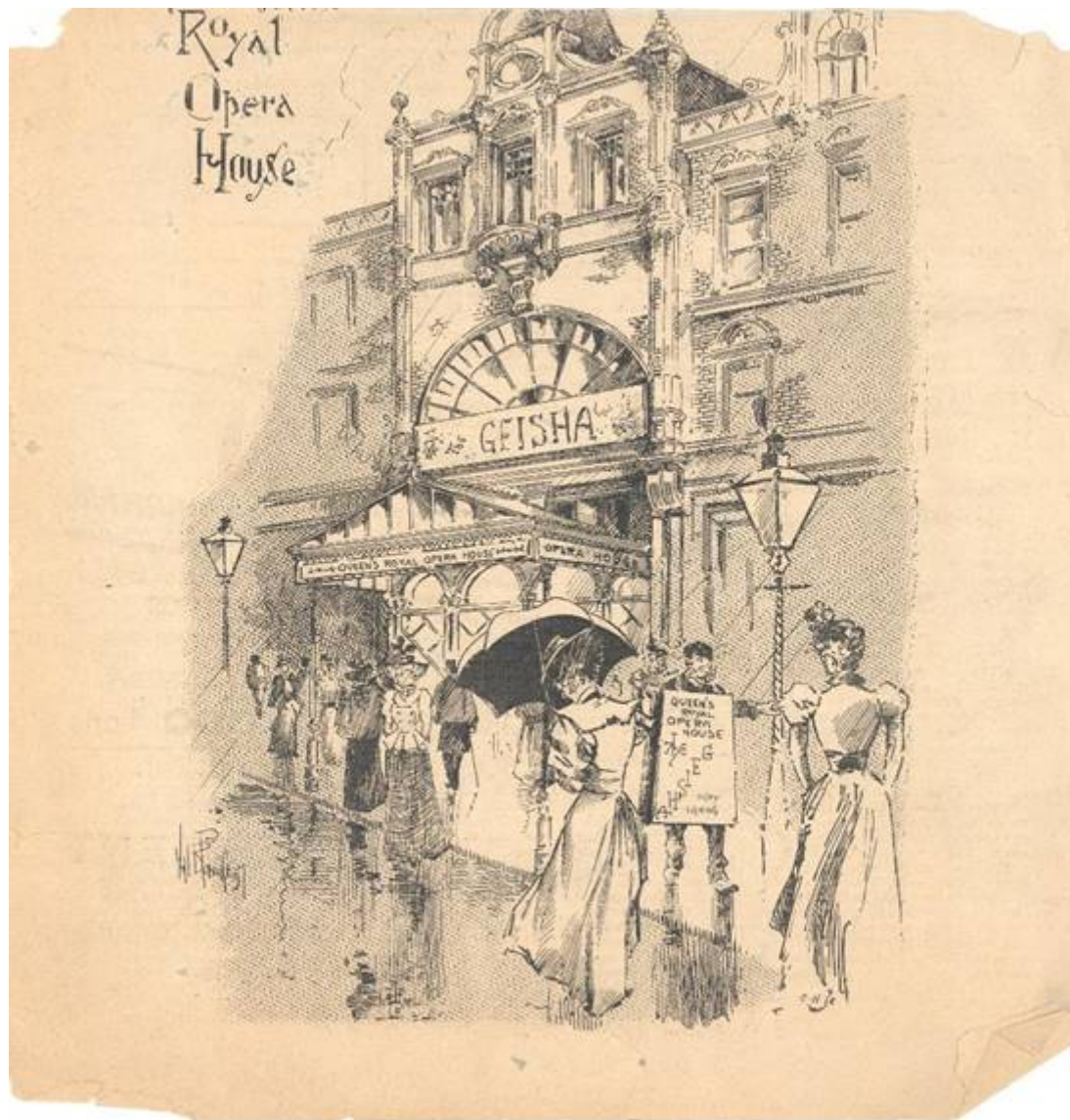
The Queens Opera House at its opening in 1897