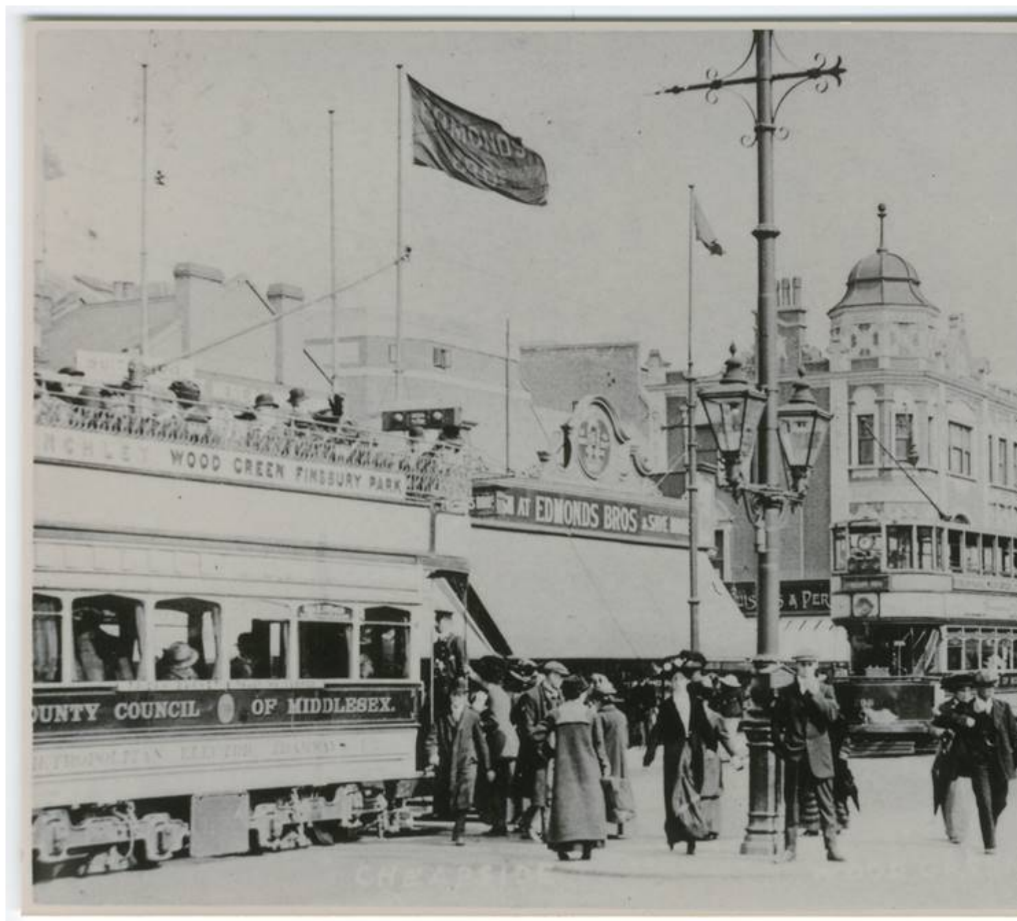
Cheapside and Wood Green High Road, with the Empire in the background, c.1910