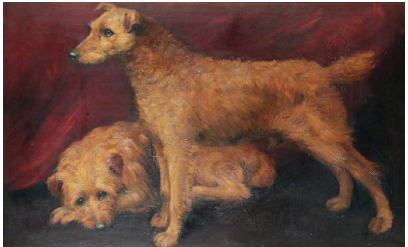
Two dogs in the painting above is equally delightful. One dog is standing, ready to hear the next command, while the other is clearly content just to curl up and snooze. I wonder if they could be mother and son, with the bouncy younger dog wanting to go and play?