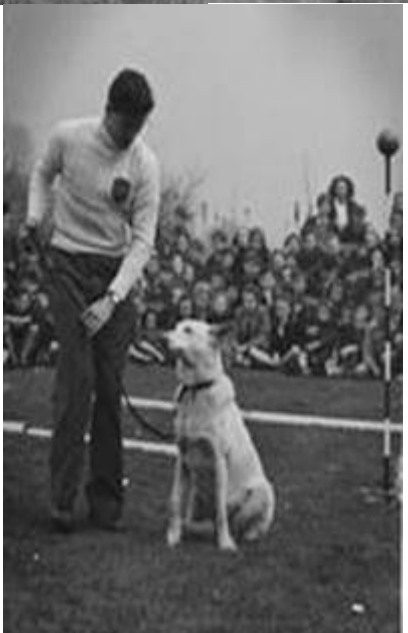
During the Second World War such dedicated training of dogs combined with the intelligence of the dogs themselves was really put the test in extremely challenging situations as can be seen below. Here a dog has been trained to help search for survivors after a bombing raid on Gladstone Avenue in Wood Green.