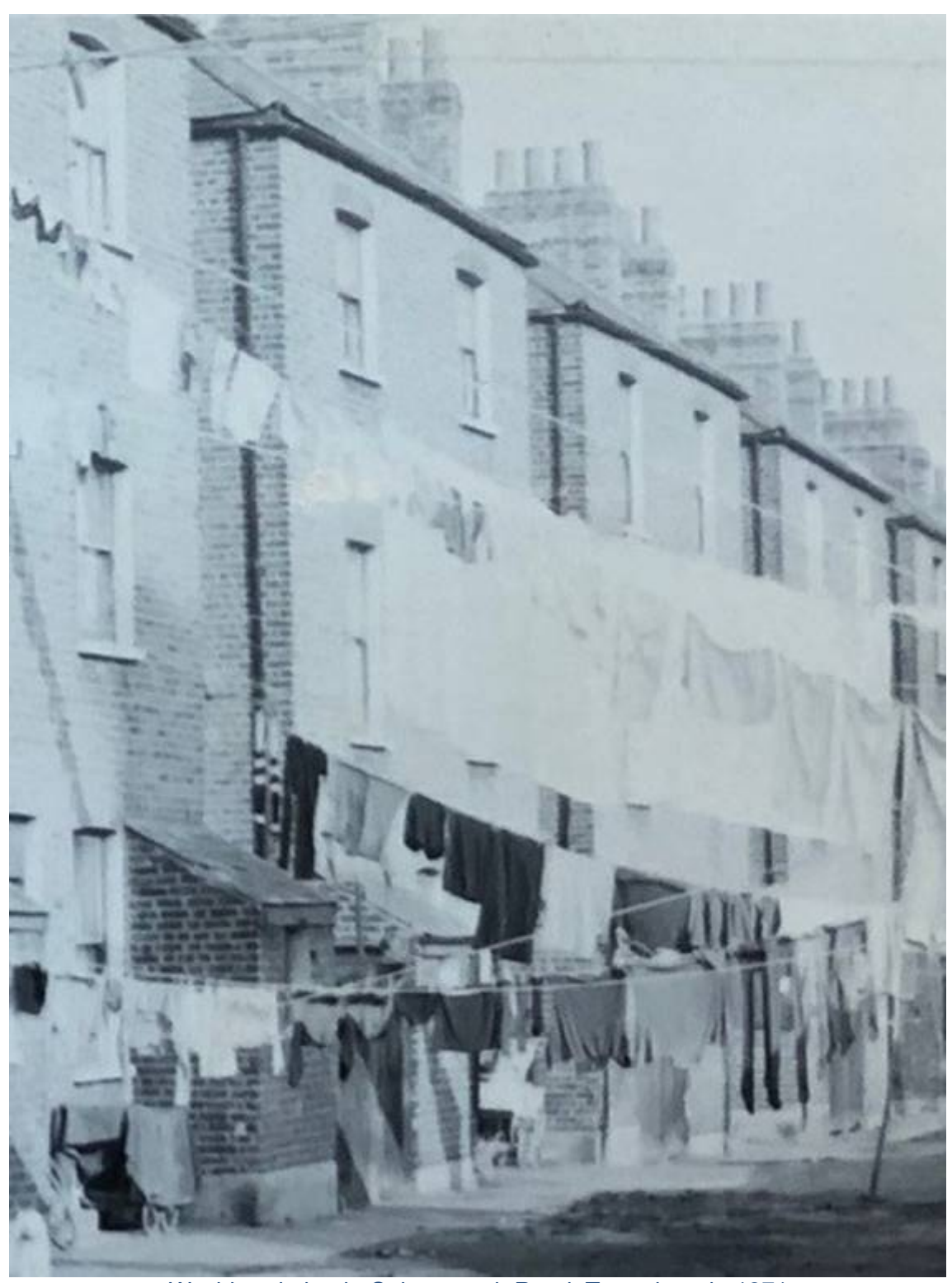
Washing drying in Colsterworth Road, Tottenham in 1971

Some of the other interviews we have of local women who were homeworkers go back to the early part of the 20<sup>th</sup> century. As mothers, often with large families, they had childcare responsibilities and yet needed to help make ends meet for the family. They tried to find whatever work they could and do it from home. Needless to say it was low paid. The work included taking in laundry and ironing for wealthier families or local churches (ironing <u>vestments</u> for clergy and the choir 'habit', for example). Other types of jobs included <u>piece work</u>, where even the children might have had to help – putting together toys, or stuffing home-made