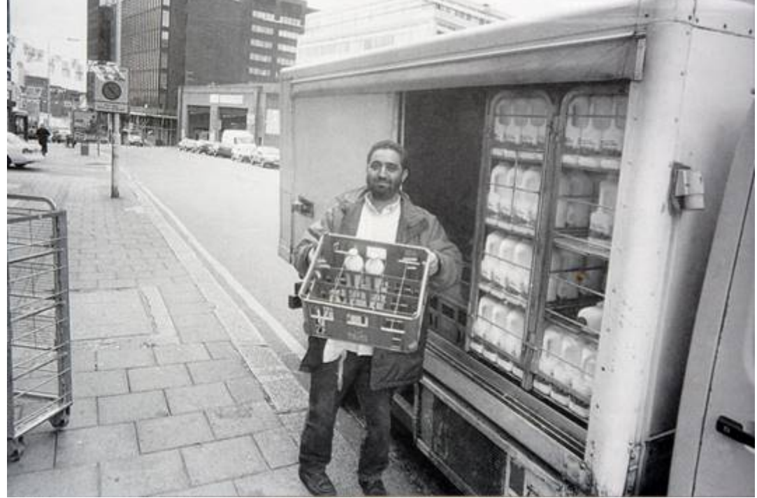
Milk delivery up Jolly Butchers Hill, Wood Green in 2002.

Right now we are very reliant on food deliveries to and from our shops and direct to our homes wherever possible. If, like me, you have a milkman, hearing the clinking of bottles arriving on your doorstep is a very reassuring sound. The milkman has been making a comeback in recent years as we wage the 'war on plastic', with more milk being delivered in glass bottles nowadays, straight to our homes. If you don't have a milkman and this brings back some nostalgic feelings, then here's a chance to take a journey down memory lane as well as giving a thought to our amazing keyworkers helping us by delivering milk today.