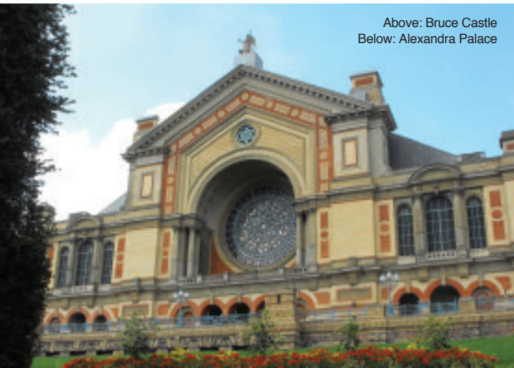
Above: Bruce Castle Below: Alexandra Palace

This directory provides information about care services in Haringey. It includes information about the types of services available in the borough and will help you to find a service that best meets your needs. You will find details on: