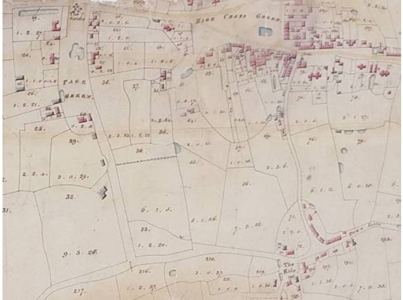
A detail of the Wyburd Survey (1817) showing Tottenham's 'High Cross Green' at the top and 'The Hale' to the bottom right.

One of the maps we'll be adding to the site will be the largest map we hold - the Wyburd Survey: A Map of the Parish of Tottenham (1817) . At a massive 270 x 177cm we are unable to allow easy public access in the Search Room as it too large to fit on our tables (we had to unroll it in the main gallery to measure it!).