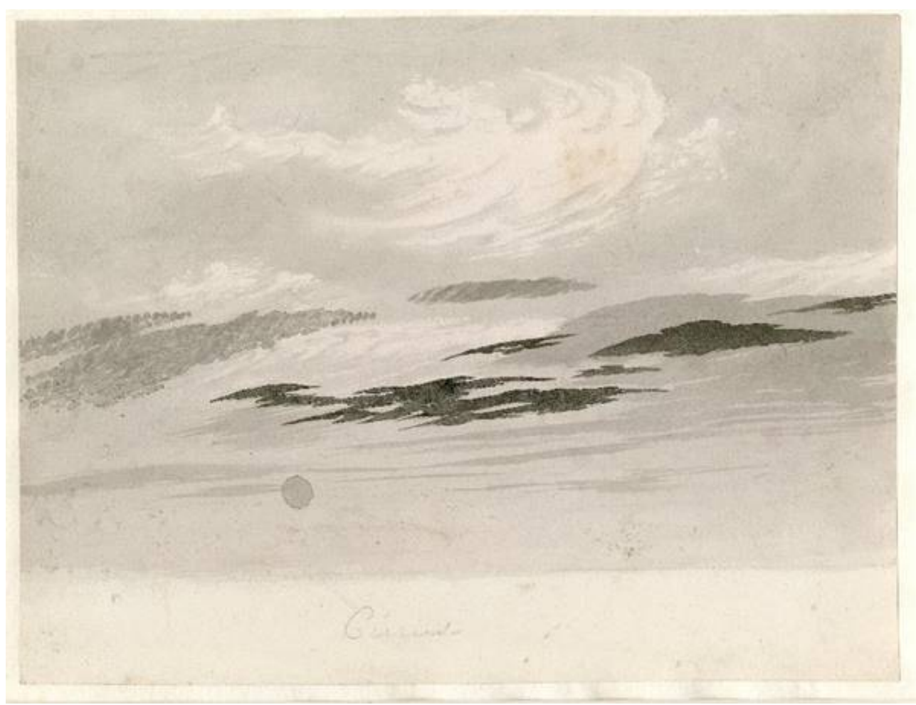
One of two original watercolours by Luke Howard as he studied the clouds, often from his Tottenham home.

Thanks to the scientists from Imperial College, we were also able to pilot a weather-station with activities for local schoolchildren as part of our Museum workshops about Luke Howard and the weather. Much fun was had measuring the speed of the wind, pretending to be a real weather forecaster on TV and carrying out simple and fun experiments such as creating a <u>cloud in a bottle</u>. Those that remember the Olympic Torch Day at Bruce Castle in 2012, will also remember that the weather-station returned to wow us with more high-tech weather inspired activities and experiments.