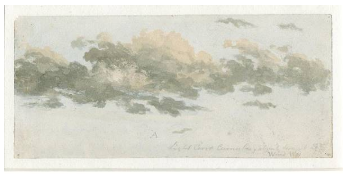
The second of two original watercolours by Luke Howard as he studied the clouds, often from his Tottenham home. Courtesy and © The Royal Meteorological Society

The extended family of descendants of Luke Howard were also generous in lending rare weather books and historical items of interest once owned by Luke for the exhibition. These were exhibited alongside a number of items from Bruce Castle Museum and Haringey Archive's own collections. One of the star exhibits borrowed from the family was the original ' Barometographia ' by Luke Howard – an astounding published record of weather-watching, with much carried out in Tottenham, from the early 19<sup>th</sup> century. You can look up weather charts and work out what the weather was like in Tottenham on specific dates. A very large volume, with beautiful images – although tricky to display due to its size - it was a wonderful addition to our exhibition. Published in 1847, Luke compiled annual recordings of the weather between his two homes – one in Tottenham and the other his summer home in Yorkshire, as well as commenting on the weather throughout the world.