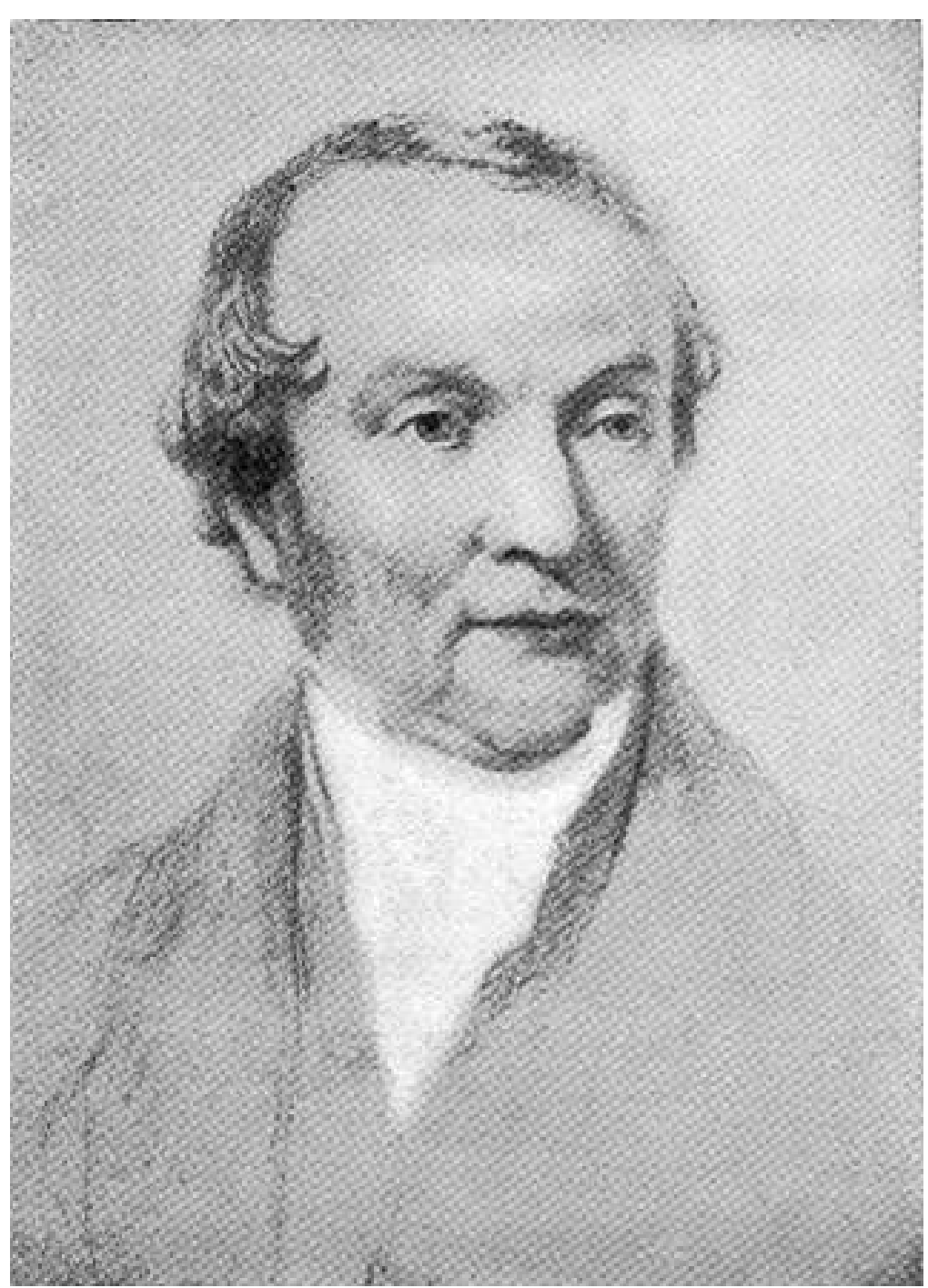
Luke Howard FRS.