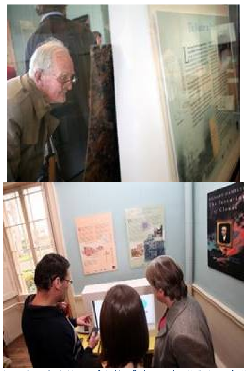
From the collections at Bruce Castle Museum & Archive.