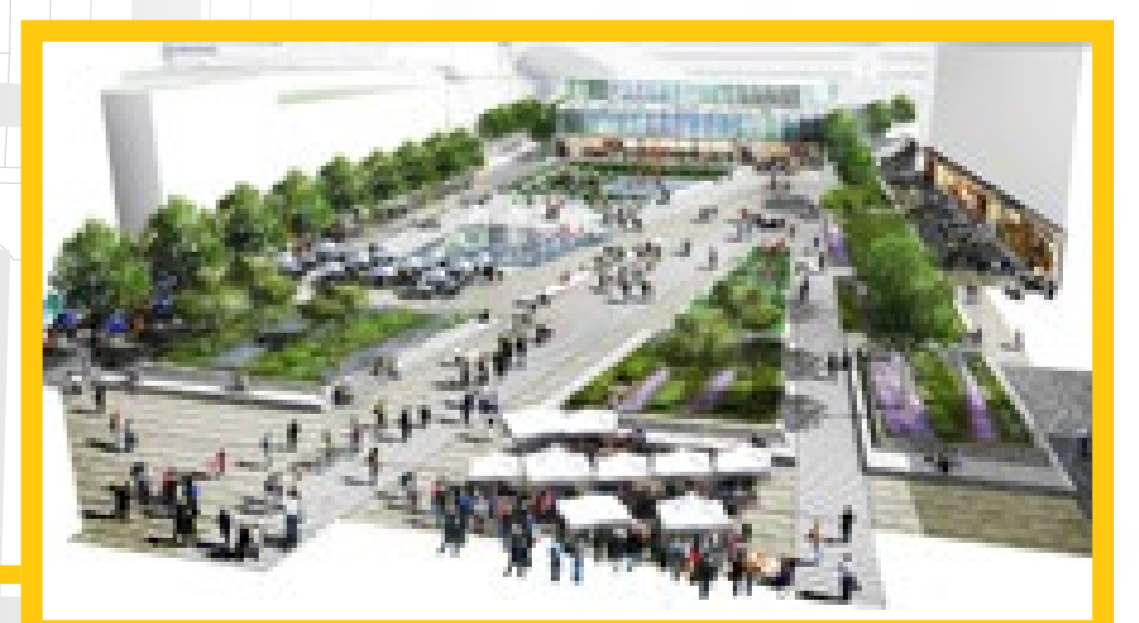
Moselle Square A new public square surrounded by leisure and community facilities and cafés and restaurants