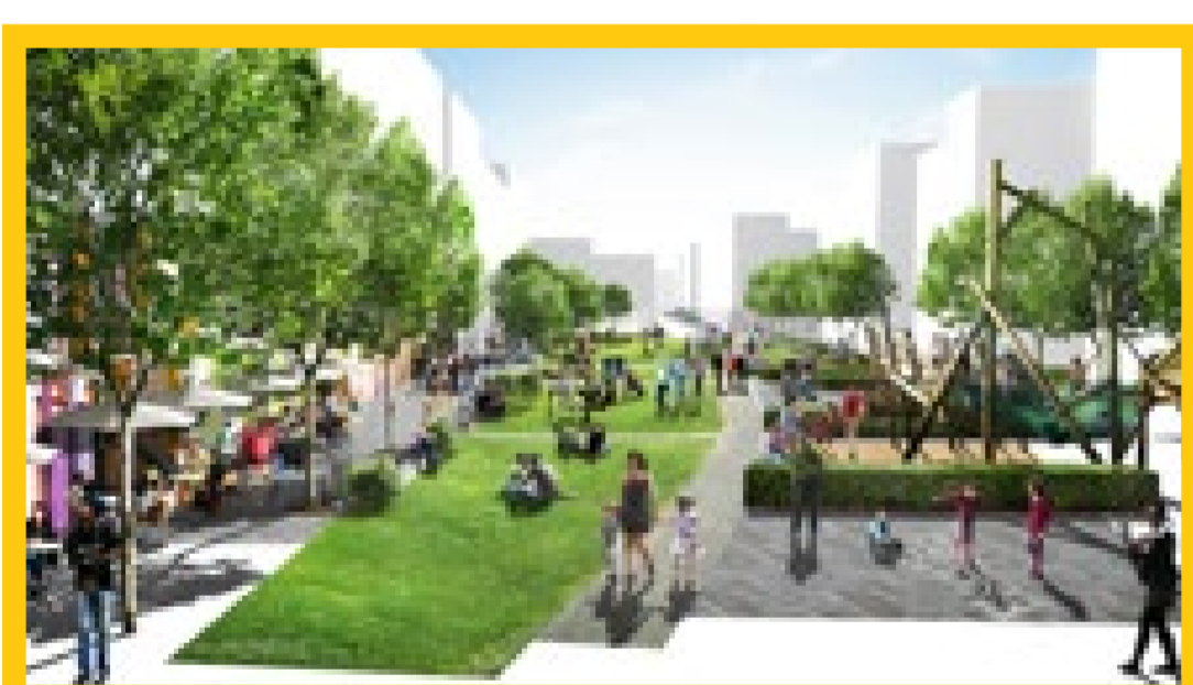
Peacock Gardens A new residential area with new homes and a large park in the north