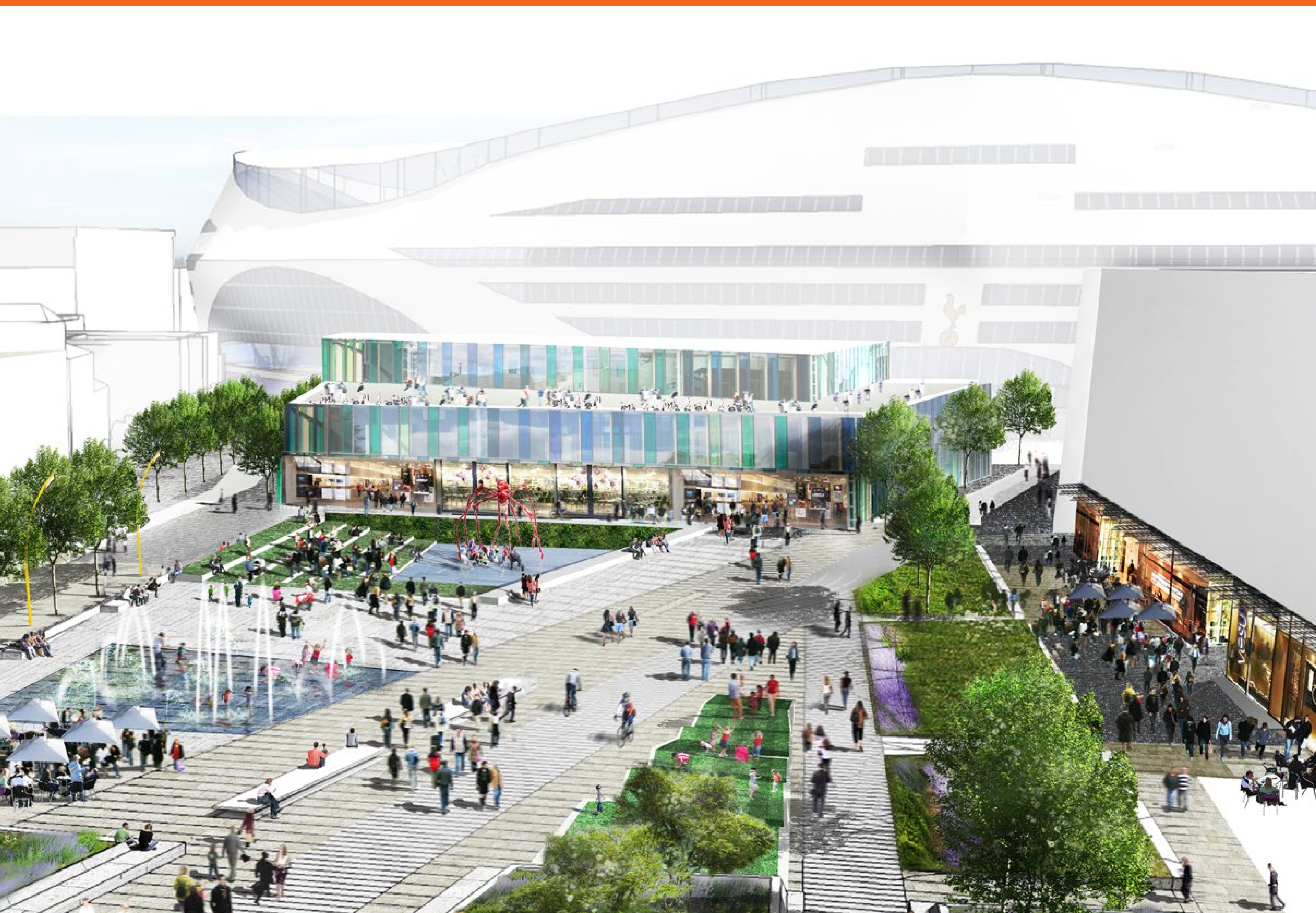
The new Community Hub