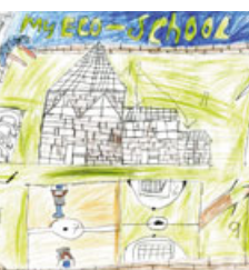
Illustration: Godwin, Stamford Hill Primary School