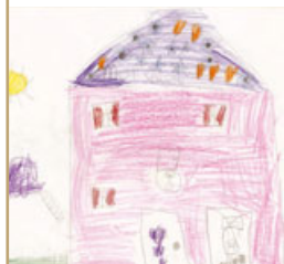
Illustration: Ella, Stroud Green Primary School