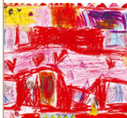
Illustration: Laila, Stroud Green Primary School