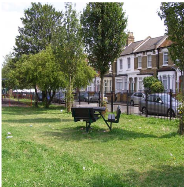
Figure 2: Picnic table at Paignton Park