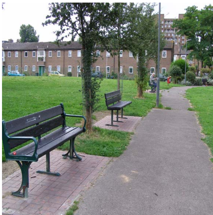
Figure 8: Paignton Park