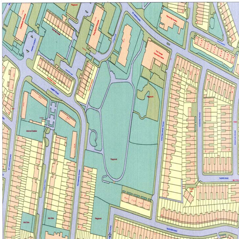
Figure 1: Paignton Park layout