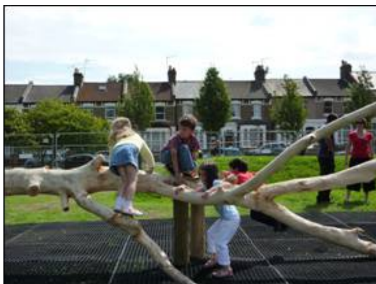
Figure 5: Natural play in Paignton Park

Visibility across the play area is good, especially for adults. The mounds do enclose the space but with wide gaps in between where the whole space is visible. The area is fenced as part of the play area and, as such, is secure within the wider park. Self-closing gates have been installed. Picnic benches have been installed to provide adult seating in the area.