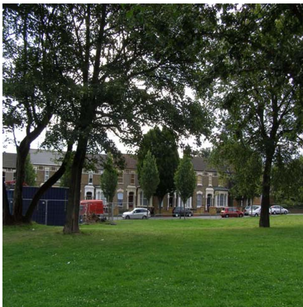
Figure 6: Paignton Park