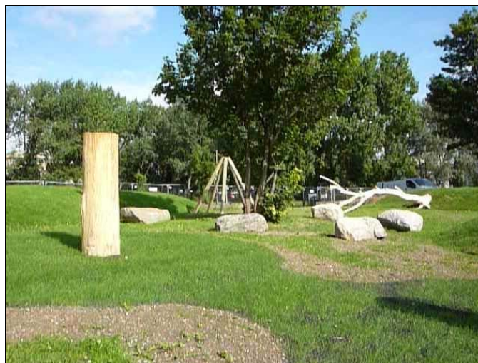
Figure 4: Natural play area

The vertical climbing logs, mounds, nets and fallen tree are included to challenge older children in the age range of 5-13+. The aim of the project is to stimulate the children's imagination in creating games and using the natural play features in different ways.