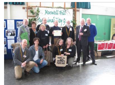
Figure 1 - MHSG members at LCZ launch.

A steering group was established to agree on the direction, expenditure, communications and other key aspects of the project. This group comprises members of the Muswell Hill Sustainability Group, local residents and staff from Haringey Council, alongside representatives from London Sustainability Exchange, En10ergy and an academic from University of East Anglia who is using the project as a case study. Representatives from local schools and the Traders' Association are also invited periodically.