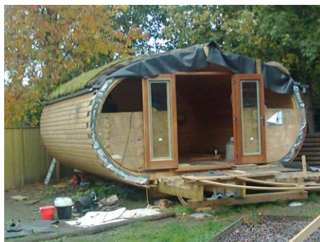
Figure 9 - The LivingArk under construction

A completely different approach has been taken at Muswell Hill Primary School, which is located within the boundaries of the Low Carbon Zone. A pioneering zero-carbon educational cabin called the LivingARK has been constructed as part of that school's nature garden, which demonstrates many different technologies and materials that have a zero environmental footprint. These include a living 'green roof', sheep's wool insulation, composting toilet, low-e glass, solar PV panel and FSC-certified wood. The LivingARK is designed to be used by schools in the borough,