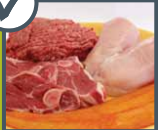
Meat and fish (no bones)