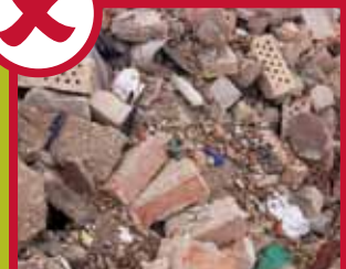
No sand or rubble