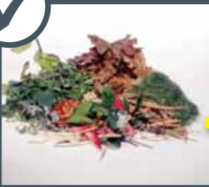
Leaves, grass and flowers