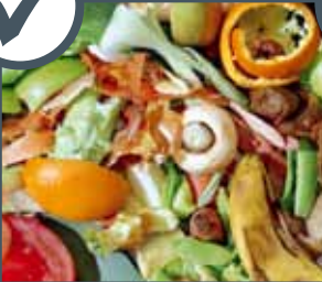
All food waste