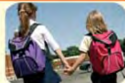
Schools and education