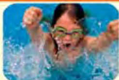
Sports, exercise and leisure