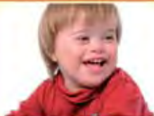
Special needs and disabilities