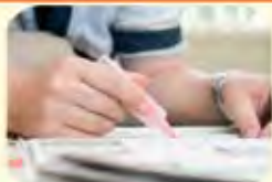
Jobs, training and courses