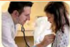
Health and social services