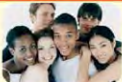
Relationships and sex