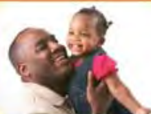
Parenting and family support