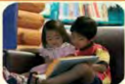
Childcare and out of school services