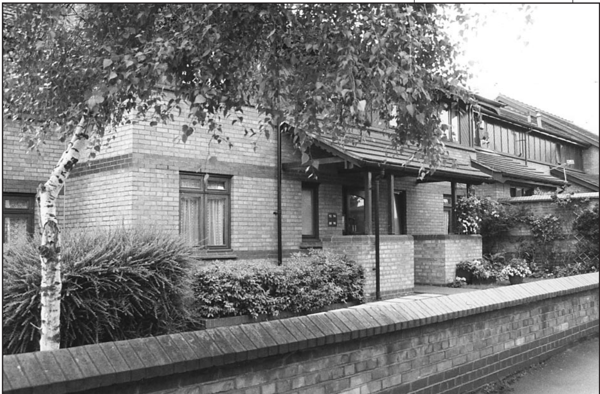
Braemar Avenue, N22