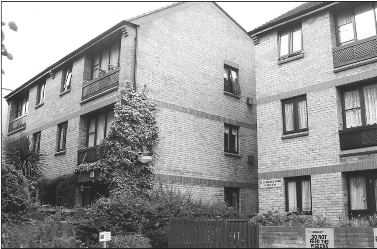
Clarence Road, N22