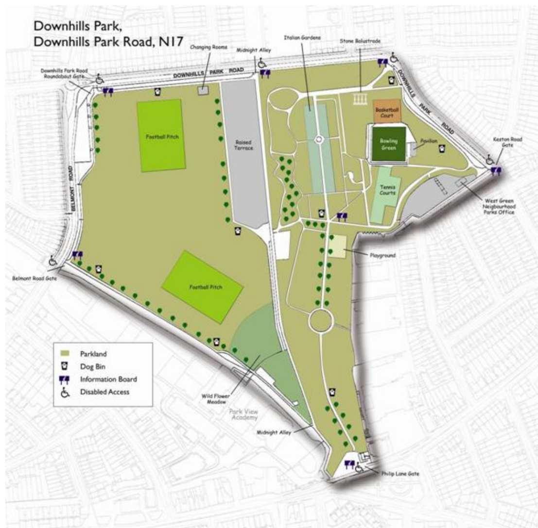
Figure 1: Downhills Park layout