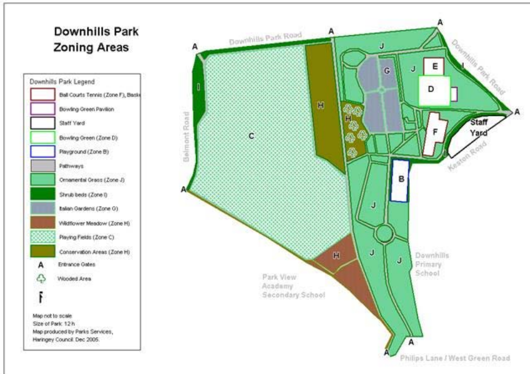
Figure 3: Downhills Park work zones