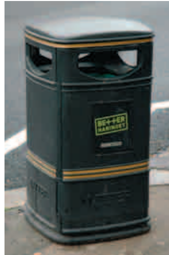
Our goal is to co-ordinate the design and colour of streetscape elements across the Borough.

This does not mean a 'blanket approach' to streetscape design. We also want to respect the diversity of the urban fabric. The specification of co-ordinated elements is a framework that allows for specific design responses at key locations, such as in town centres and conservation areas. For example, Wood Green has a range of distinctive streetscape elements that depart from the standard elements. Other parts of the Borough, (e.g. Seven Sisters and Bruce Grove town centres) have particular street lighting columns.