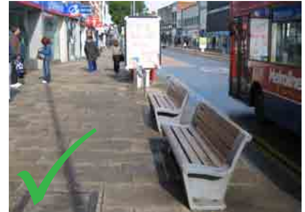
Good practice – furniture located on the kerb side, maximising clear width for pedestrians (Wood Green Town Centre).