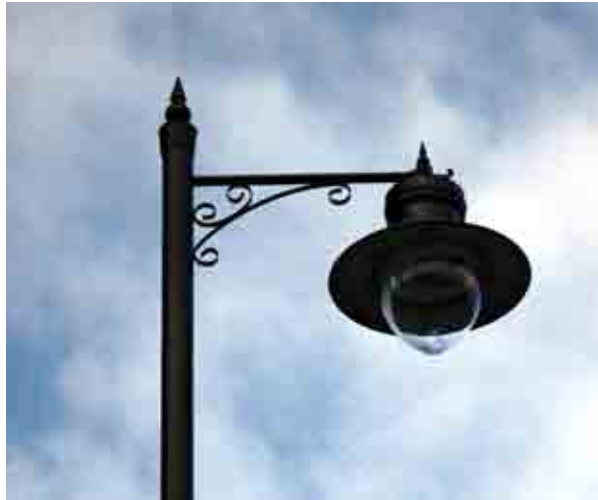
We want to protect and enhance the historical character. Special streetscape elements will be retained or reinstated where appropriate