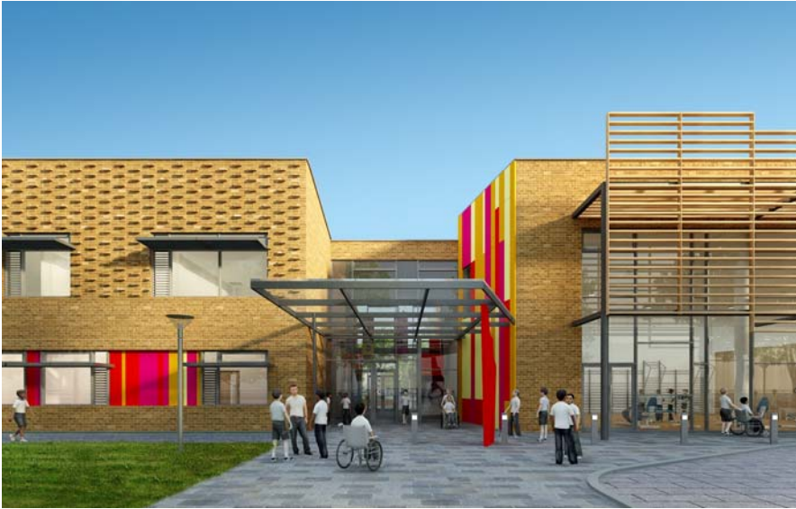
Above: an image of how the learning campus could look

Work is set to start on creating a new educational building to support primary and special school children. The modern building in Adams Road N17 will include: