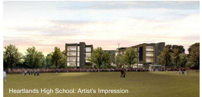
Heartlands High School: Artist's Impression

Estimated Construction Start Date: September 2009 Estimated Completion Date: Estimated 2010