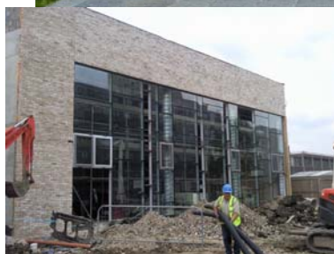
Above: Broadwater Farm ILC. Below: Rhodes Avenue Foundation building.