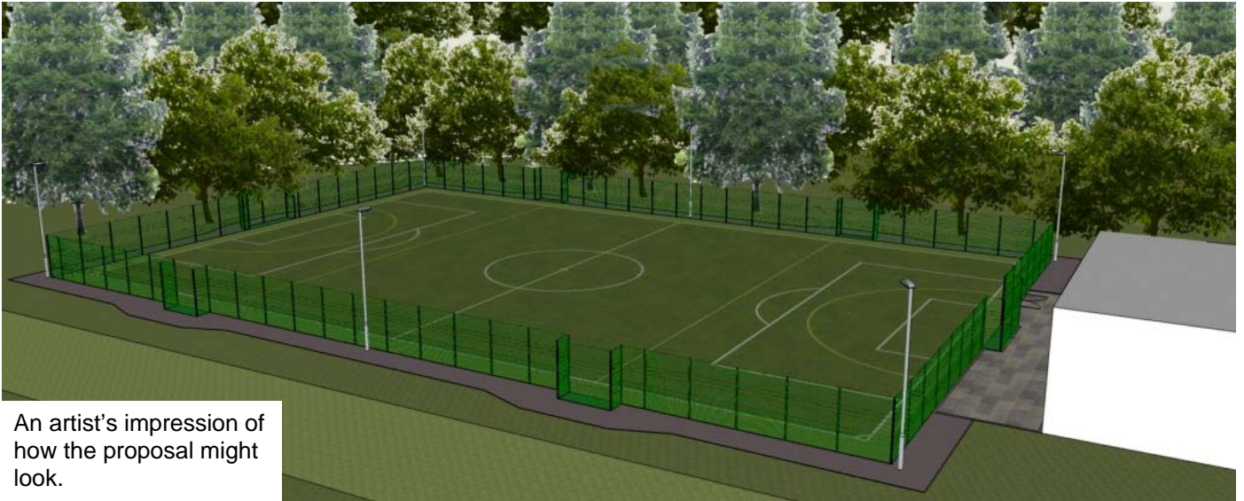
An artist's impression of how the proposal might look.

Alexandra Park Club, Heartlands High School and Haringey Council are working together to improve the clubs pitches and clubhouse.