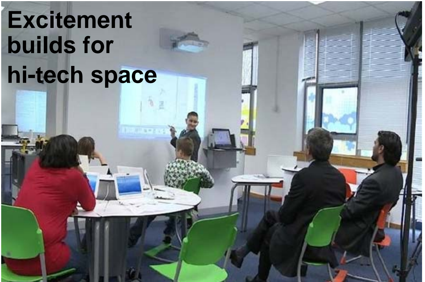
An innovative new space for schools across the borough is set to open its doors shortly.