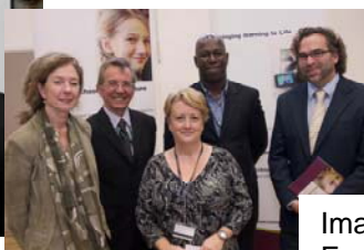
Images clockwise from left: The opening of The Octagon, Fortismere Music block, moving into Heartlands High, awards in our photography competition and ‘topping off’ Woodside High.