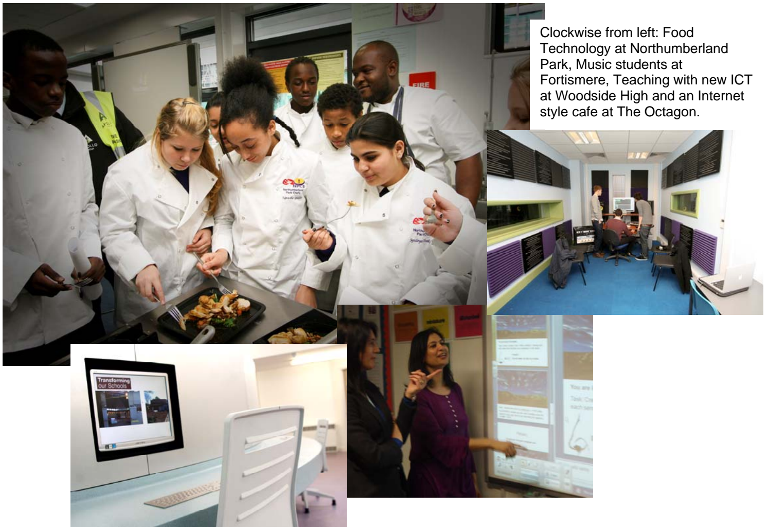
Clockwise from left: Food Technology at Northumberland Park, Music students at Fortismere, Teaching with new ICT at Woodside High and an Internet style cafe at The Octagon.

Whatever the subject; the new resources and first class facilities are helping schools to meet the aspirations of its students and respond to changes to the curriculum.