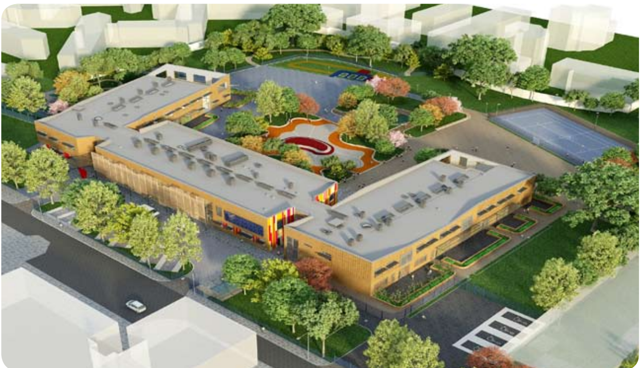
An image of how the new campus could look

Shortly after the schools break up this July you will see work starting on building the new inclusive learning campus.